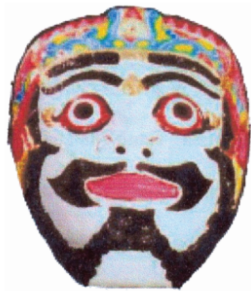
Figure 2: Topeng Tih (Putih) Color: white Face shape: ovate Full form: gold jewel Eyebrow shape: Blarak sineret Eye shape: Telongan Eye corner: trate sinigar Nose shape: mangot Mustache shape: keenteng tap Mouth Shape: mingkem

It can be seen that the mask has a strong character. However, when viewed from the color of the mask, that is, the red one has the impression of being dashing (tends to the sabrang figure) and the white one has the character of a fine, wise character (tends to the Javanese figure). In this case it has a meaning, that in humans there are always two opposing qualities, such as cruel patience, arrogant friendliness, honest cheating, disobedience, and so on. This dashing character can be especially noticed and seen from the shape of the eyes, nose, eyebrows, and mouth. Plolongan eyes that are round and impressively glare and are affirmed with sineret blazed eyebrows that are thick and slightly raised, giving the impression of masculinity or virility.