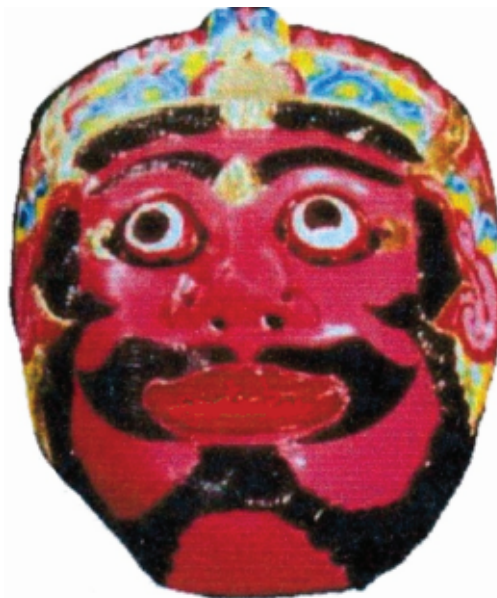
Figure 1: Topeng Bang Color: red Face shape: ovoid Full form: gold jewel Eyebrow shape: Blarak sineret Eye shape: Telongan Eye angle: trate sinigar Nose shape: mangot Mustache shape: keenteng keentuk Mouth shape: mingkem

The mask form used in the patih mask dance is a mask with a strong character, similar but different in color. Thus, if we look closely at the actual shape of the two masks, the one that is 'double'. In other words, 'one in two' or two are actually one, two bodies of one soul. Note the image of the Patih mask below;