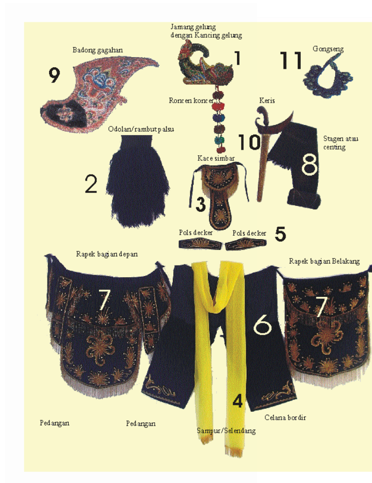
Figure 3: Patih Dance Costume

For more details, consider the picture below which describes the various types and names of clothes worn by Bangtuh or Patih mask dance.