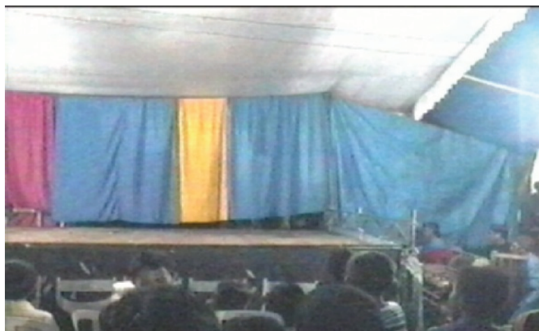
Figure 4: the stage (front view)

After the 1970s, it was very rare for people to put on a puppet mask show in the front yard of the house in the form of a stage platform. Which is still often staged using the stage platform is a performance Jaran Braid or lumping horse. Whereas puppet mask shows always use an emergency stage, it is common for people to call genjot. Like the plataran stage, genjot is also limited by a cloth that is placed from left to right and from right to left, thus forming a meeting in the middle (fighting butterfly). The back drop cloth meeting is used as the entry and exit of the dancer. The stage in the form of this genjot, the location of the pengrawit / panjak is usually on the left, or right of the stage. But if forced to be placed in front of the stage, or even behind the game arena.