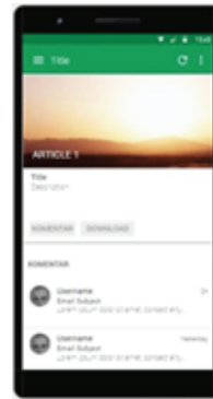
Figure 3: Post and Comment Interface