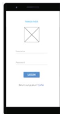
Figure 4: Login Interface

and password to open profile access. If the user is not yet registered, then you can register on this page too.