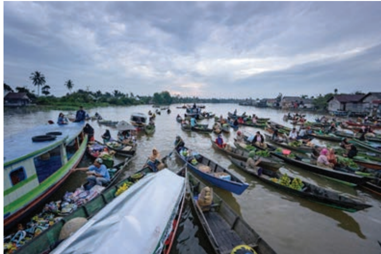
Figure 10: Crowd of Lok Baintan floating market.

in their rowboats, and the distinctive smell of river water, the sound of motorbikes, the buzzing of traders' babbling, and the rise and fall of river ripples become an authentic experience for the visitors.