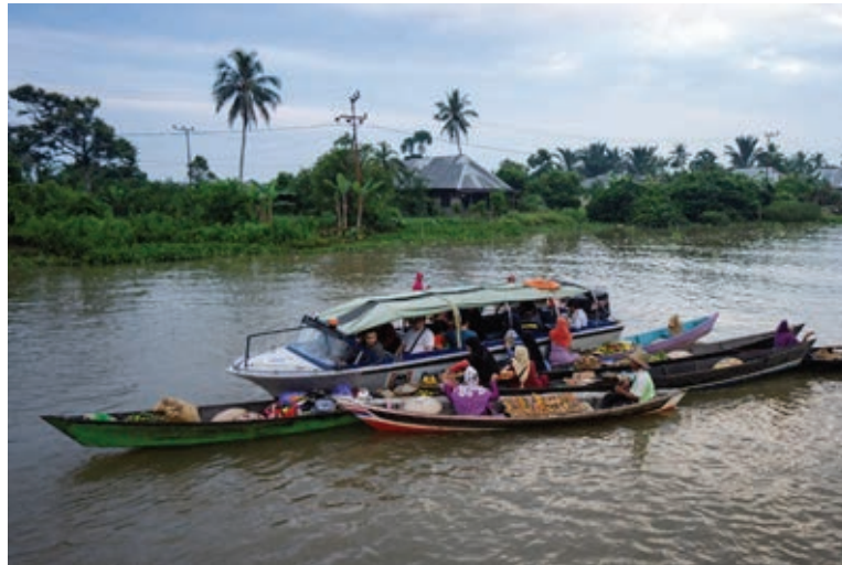
Figure 7: Transaction process between sellers and buyers at Lok Baintan floating market.

In addition to interactions between sellers and buyers, another activity that is not too visible is the trading activity between the women traders themselves. They do not necessarily buy and sell their own products, but often through barter, as done since hundreds of years ago.