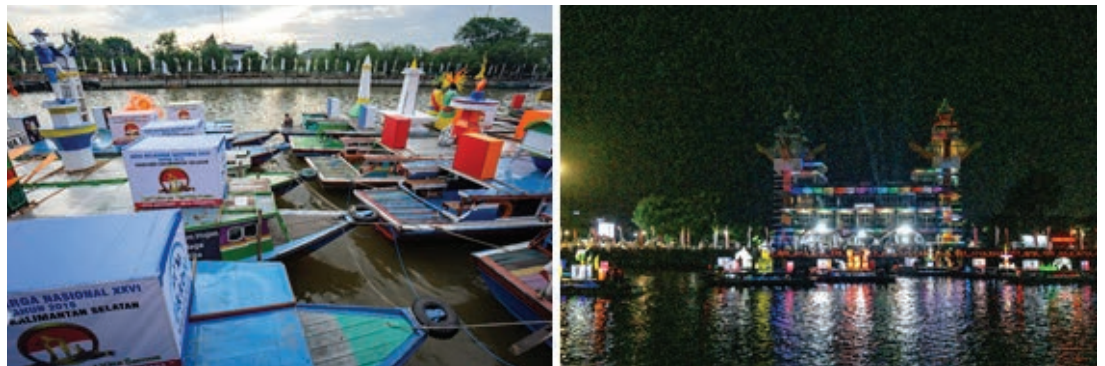
Figure 6: Festival of ornamental jukung in day and night.

Furthermore, promotion done by the local government, the Banjarmasin Tourism Office, is in form of having several events to enliven the market. The government also provides rowboats for those who want to visit Lok Baintan, which takes at least one hour from Banjarmasin City.