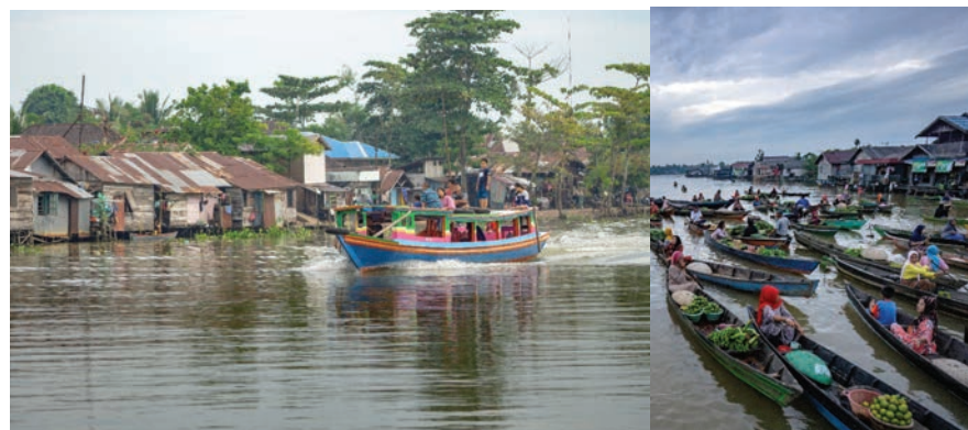
Figure 2: Trade and transportation activities carried out by Lok Baintan residents on the Martapura River..