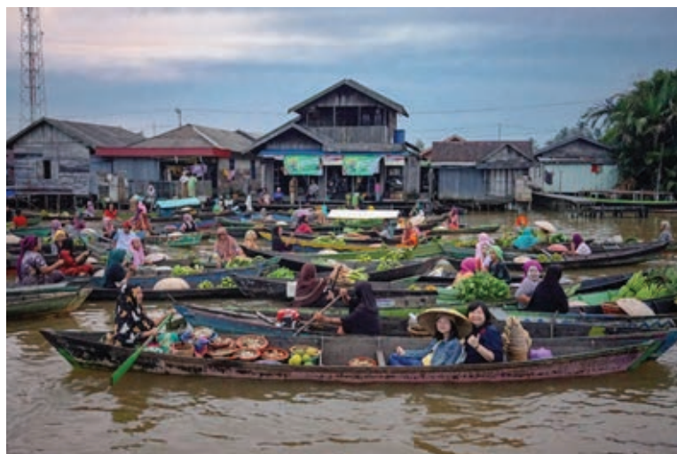
Figure 11: Jukung and Klotok as main transportation at Lok Baintan floating market.