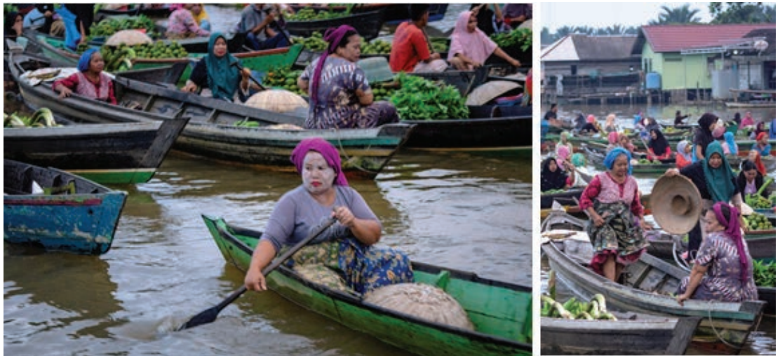
Figure 9: The unique characteristics of acil ( pupur , caping purun and veil), sellers of Lok Baintan floating market.

The traders are mostly locals from Lok Baintan. Averagely, their husbands work in the fields as farmers or ranchers, while the women sell their products in floating market. The women are quite friendly to both local and international tourists who visit their place. They understand foreign languages enough to make transaction. As their custom, the traders usually sing when asked, and when the transaction is over they will immediately give a spontaneous, various rhyme to entertain their buyers. Not only that, if visitors buy a large amount of their products, they give additional service such as allowing the visitors to ride their boat and take photos for their Instagram content.