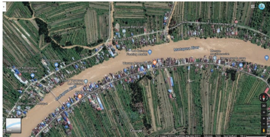
Figure 1: Lok Baintan Floating Market Area seen from aerial imagery.