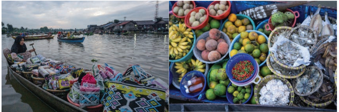
Figure 3: Product variants in the form of handicrafts (left) and fresh products, such as fruits and fish (right).

For packaging, the traders still use woven bag from purun to give the impression of local and traditional product.