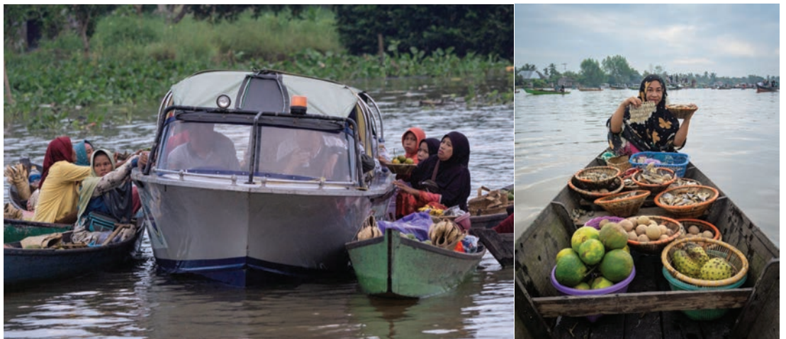
Figure 5: Friendly traders who maintain a bargaining system in determining the selling price of their merchandise.

The price fluctuates depends on how many buyers or visitors come to the market at the time. Friendship discounts are often given by the traders. Friendly society and the long-used bargaining system make visitors feel that the price offered is reasonable enough.