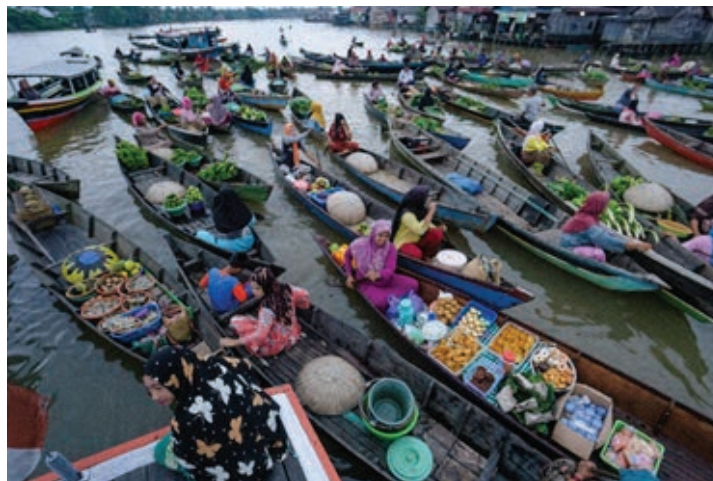
Figure 8: Sellers interaction at Lok Baintan floating market.