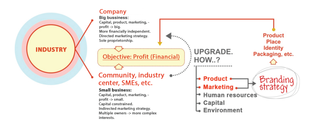
Figure 4: Branding strategy to achieve the financial gain.

The relationship model of tri-lateral network and hybrid organizations [3], as an effort to empower communities and develop creative industries, involves three roles namely government, academia, and industry. In the case of developing a branding strategy at the Derwati salted egg industrial center, those who act as community developers are academics who offer ideas, systems, and design solutions for the branding case of industry center product. Academics act as a designer to solve various marketing problems related to branding.