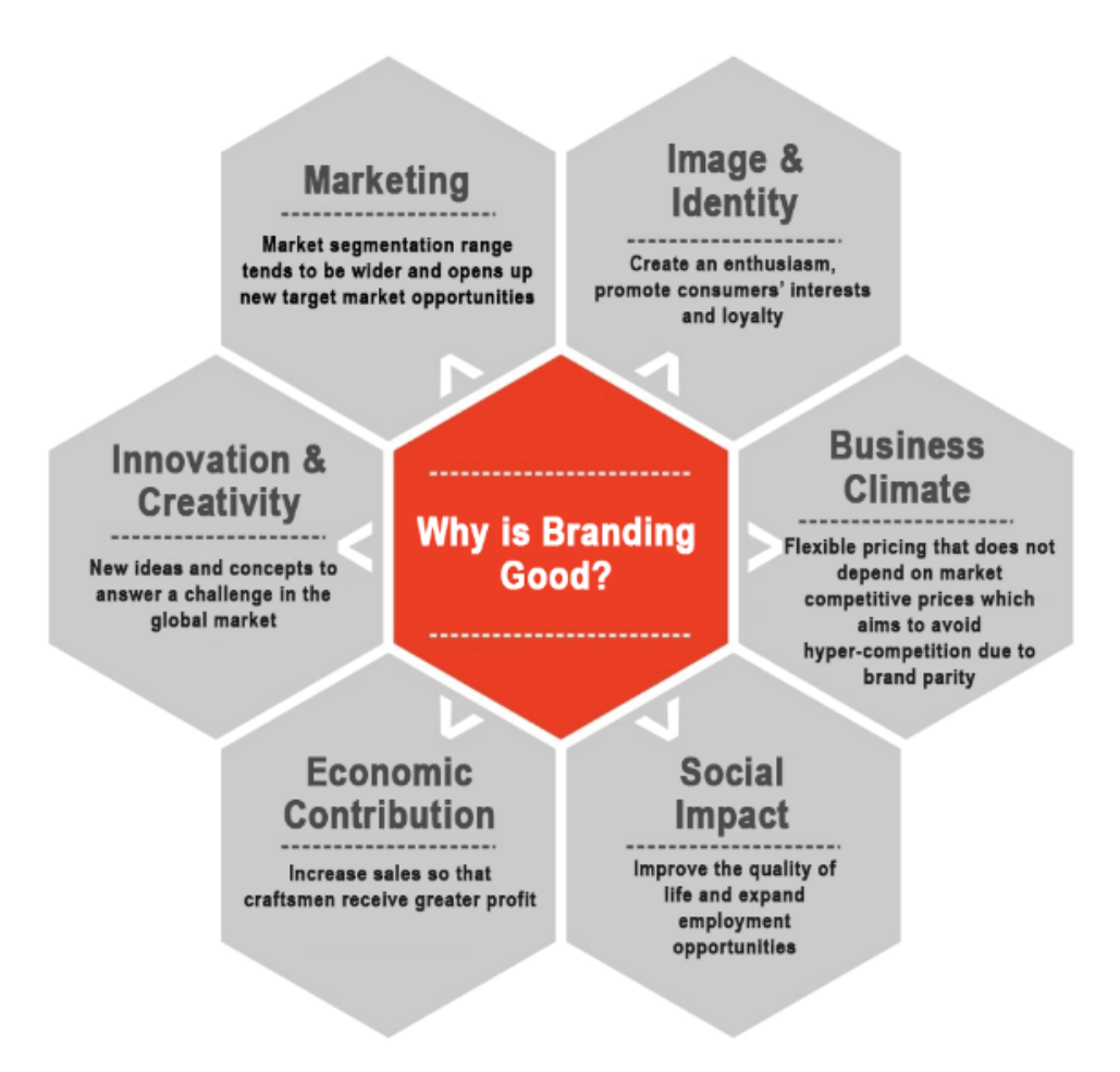
Figure 3: Branding in the development of creative product and community.

not have an identity so that consumers consider that all products are the same and the advantages as well as benefits of the product are not conveyed properly.