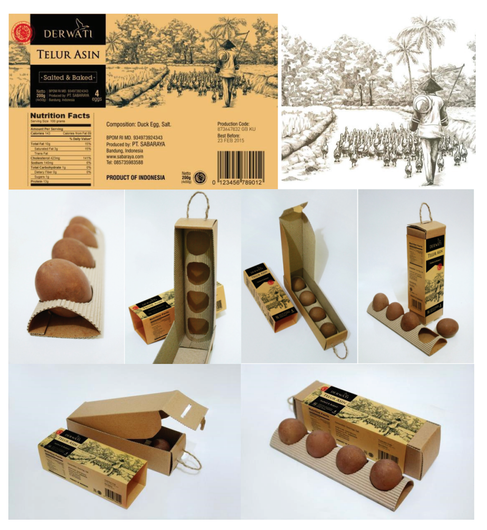
Figure 6: Packaging design implementation.