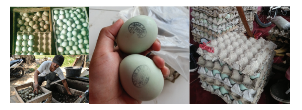
Figure 1: System of labelling and packaging on the salted egg.

egg products compared to other salted egg products are they use natural ingredients and still use the traditional manufacture to process the products. So that the final taste has the right composition, savoury, delicious, and soft texture. The Derwati salted egg is marketed offline through some stalls ( warung ), the Padang restaurants, cooperatives, and markets. Instead of the salted egg craftsmen sell their products directly, distributors take the products from the egg craftsmen then leave their eggs to stalls, markets, and others.