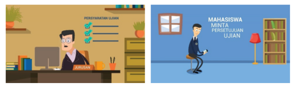
Figure 3: Design Result.

results are rendered according to the MP4 format specifications, HD 720p (1280x720 px) and 16:9 ratio. The results of this rendering are then used as test material.