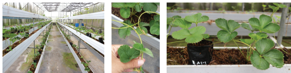
Figure 1: Parent plants growing in the greenhouse (a) with stolon (b) treated by mixed biofertilizer while still attaching to their parents (c).

Planting media were prepared manually by mixing the cocopeat and chicken manure evenly in a bowl. The composition of both ingredients was according to the treatments described above. As much as 40 g of substrates were put in the 12 cm x 5.5 cm perforated black polyethylene bag (polybag). Biofertilizer were applied to the growth media by injecting 2 mL liquid biofertilizer in order to obtain the final bacterial and fungal cell density of 10^7 and 10^5 CFU/g substrate. The inoculated-substrate were then incubated for six days in the greenhouse prior to planting the runner. One rooted-runner with two open trifoliate leaves from single parent plants (Fig 1b) were grown in polybag contained growth media. The treated seedlings were put in the PVC in adjacent to their parent plants (Fig 1c).