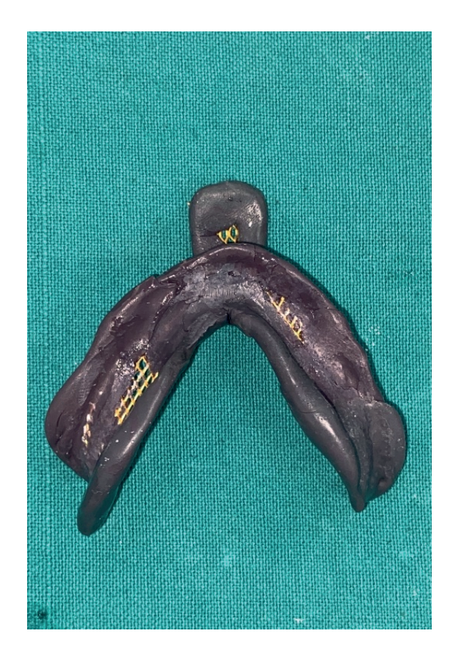
Figure 3: Mesh outlined with admix material.