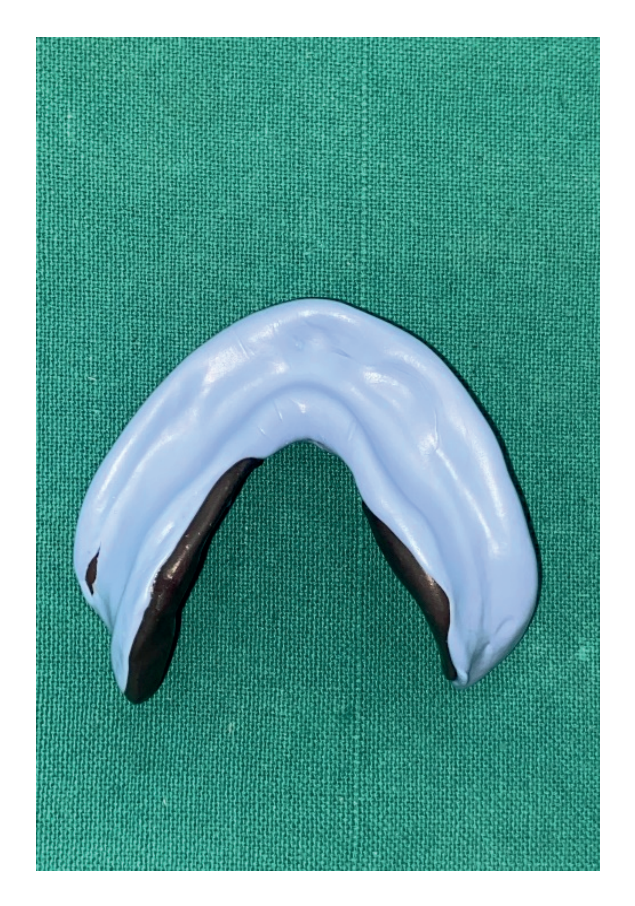
Figure 4: Impression made with polyvinyl siloxane impression material putty.

an accurate first impression [14]. A successful preliminary impression yields a well-contoured denture, an accurate wash impression, and an extended border moulding [15].