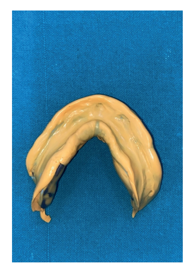
Figure 5: Wash impression made with polyvinyl siloxane light body consistency impression material.

The preliminary impression was created with polyvinyl siloxane impression material [18]. This material was chosen because it is simple to mix, is available in all four consistencies, has a high viscosity, can be poured up to a week later than usual, poured repeatedly, is easily adaptable and strengthened with metal mesh, and can reproduce excellent surface details [19]. The proposed material enables further extension to regions that the impression tray might not be able to sustain. Moreover, it provides a longer and more satisfactory working period of about 4-6 minutes [20], which gives the dental surgeon more time to cover all the lingual, buccal, and labial flange areas.