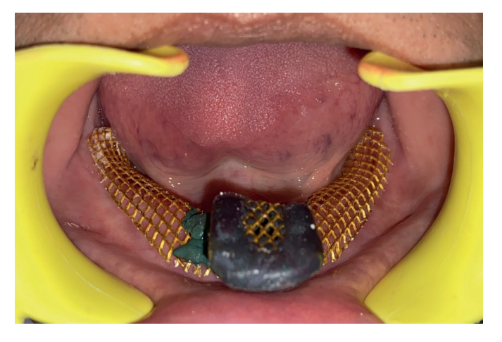
Figure 2: Custom preliminary impression tray in patient's mouth.