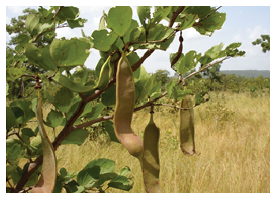
Figure 1: Fruits and leaves of P. reticulatum.

This study was conducted to evaluate the antimicrobial activity of P. reticulatum on selected bacterial and fungal spp.