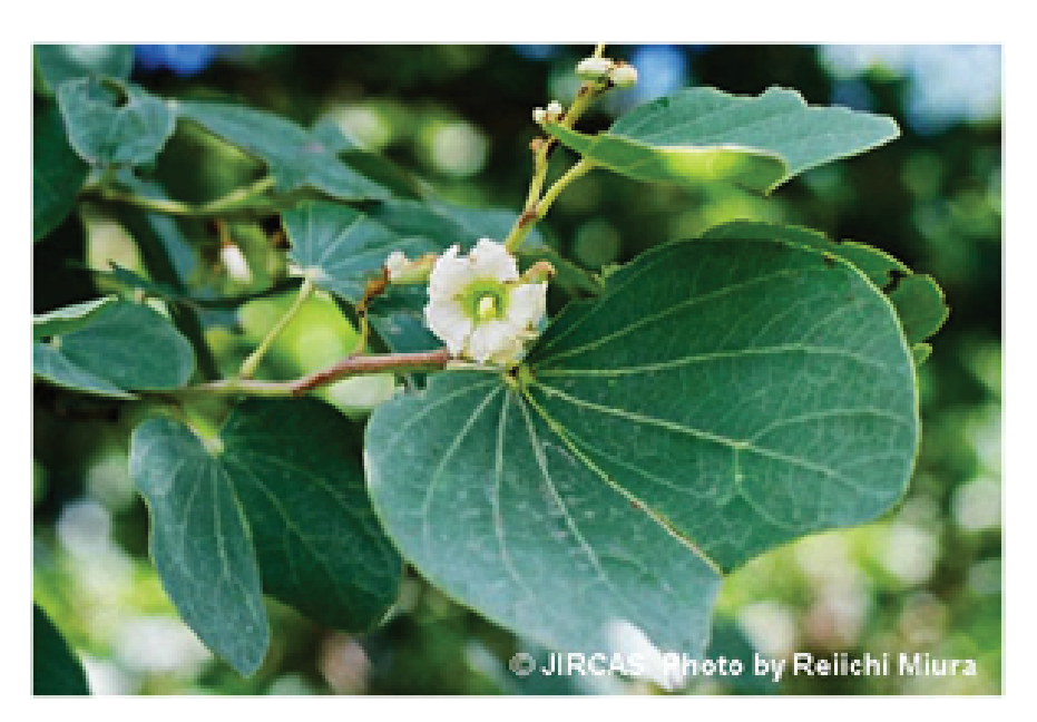
Figure 2: Leaves and flowers of P. reticulatum.