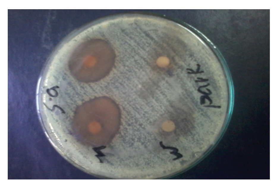
Plate 1: Invitro antimicrobial activity of P. reticulatum Bark extract (m) methanol extract (w) water extract against Staphylococcus aureus.