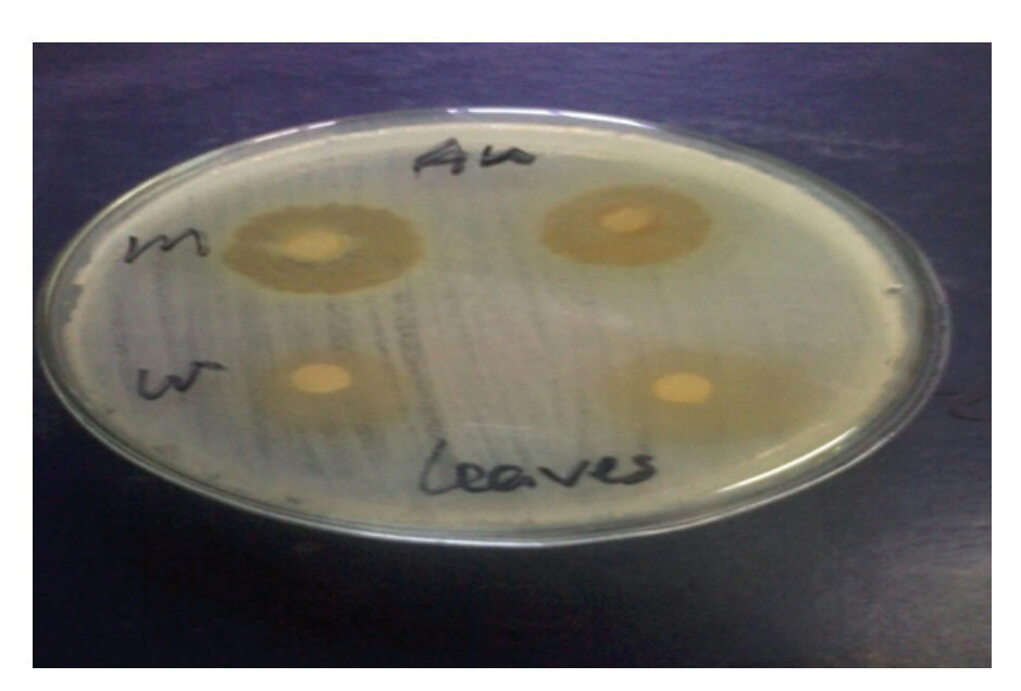
Plate 3: Invitro antimicrobial activity of P. reticulatum Leaves extract (m) methanol extract (w) water extract against A. niger .

types of extract, moreover the concentration of the active ingredient is probably higher in the bark than the leaves. This can explain why bark extract was more effective than the leave extract.