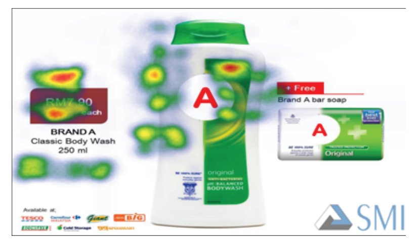
Figure 2: Heat Map on the Single-subject Level on the 4Ps Marketing Mix using Eye Tracking.

and attention. They also mentioned about the attractive packaging usually having two important factors that are colors (multi-colored and bright) and shapes (oval, rectangular and abstract shapes). Both factors can contribute to drawing attention and processing of spatial information related to episodic memory. Figure 2 illustrates a heat map on the product, price, promotion, and place (4Ps) on a green product. The following statistical parameters are shown to dwell time and average fixation.