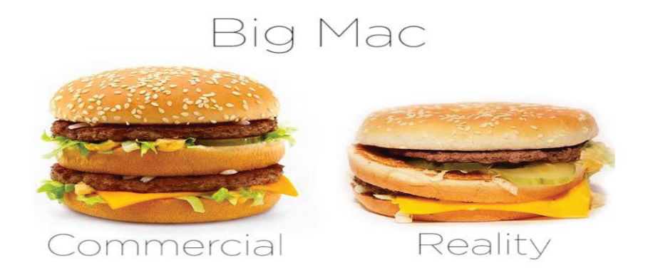
Figure 3: Example of Mc Donald's Menu in Commercial versus How it Looks Like in Reality.

The question of whether exaggerated advertisements are ethical or not is still and may forever be a continuous debate. Ethics critics, with their stance on the concept of benevolent, argue that these kinds of advertisement are like a bad trick to influence consumer behavior. However, this claim can be counter-argued by the fact that even though consumers' mind has been injected with these pretty and delicious advertisement, it does not disturb their autonomy and freedom of choice. They are still free to make their own informed decisions on whether or not to buy the advertised product. Besides, in the case of Mc Donald's and KFC, most of their loyal customers prioritize the taste instead of the look. Hence, as long as this issue is acceptable by consumers, it can be said that no harm or malicious tactic is being practiced.