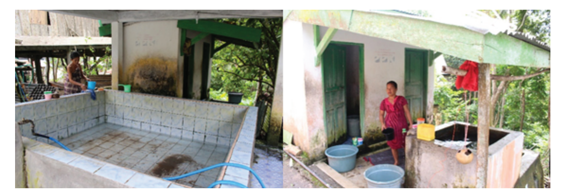
Figure 5: Public Facilities of Clean Water and Sanitation in Bitombang Village.

The hilly topography of the area also influences the condition of facilities and infrastructure in Bitombang Village. To access clean water, people get help distributing water from a spring on a hill that is channeled through a gravity system. As for access to sanitation, for the washing needs of the community, there is a dishwasher inside the house by taking water elsewhere. Whereas for bathing and latrines were carried out in public facilities assistance from the Program Pembangunan Kecamatan (PPK) or District Development Program in the form of water reservoirs and MCK located at several points in Bitombang Village.