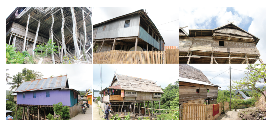
Figure 6: Wall and roof material variation used.