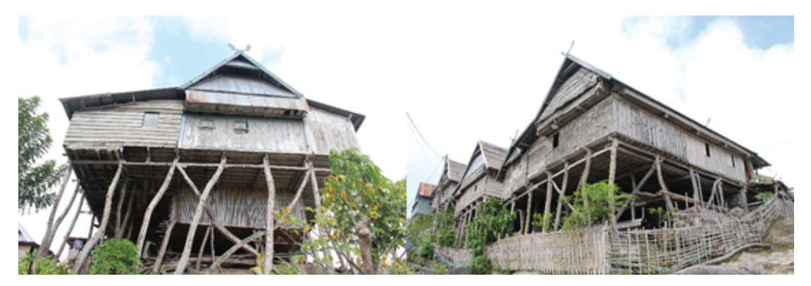
Figure 4: Backside of Houses.

For this reason, to build a house, a Mataguri (mahaguru) is needed. Mataguri is a person who is an expert in building houses, and is trusted by local residents to have the spiritual power that will fill the house that he will build [8]. This makes the tradition of building houses in this village must be followed by rituals to ask blessings for families