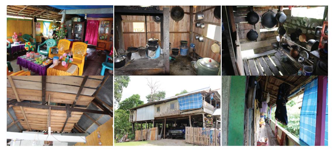
Figure 7: Interior and Exterior Function.