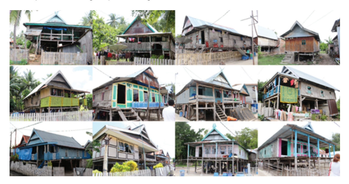
Figure 9: Compilation of Current Forms of Application Selayar Traditional House.

were used as kitchens and other service needs. The shape of the structure used at the beginning is a wooden structure with a bolt-free connection. The use of wood materials is based on consideration of the availability of local materials that existed in the past. Until now there are still many residents who apply the stilts house with Selayar vernacular architecture design. The following is a picture of a stilt house that is still used in Selayar Islands Regency, in its original form: