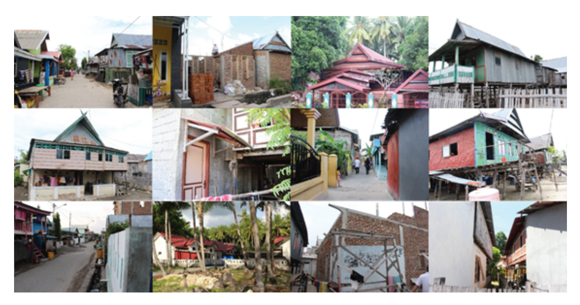
Figure 10: Compilation of Current Forms Modification of Shape and Material Used in Selayar Island.

gradually building a family room until the next to dismantle the stilt house. People prefer to use "stone" houses" (Hikmatul, 2018)