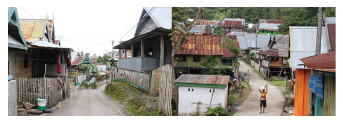
Figure 3: Frontside of Houses.

This village is located on the slopes and hillsides. The house in Bitombang village was built with a tall pole, as a form of adaptation to the land contour, and according to residents, it was done to avoiding many thieves in the past. The house in Bitombang is located on a hillside, with towering poles on the back, and low on the front. Rear pillars range from 10-20 meters, and the front is only 2-3 meters [8]. People built a house starting from the selection of the passiringang place which means "shelter" to establish land. From this word, the word siring appears, under the house when a house has been built.