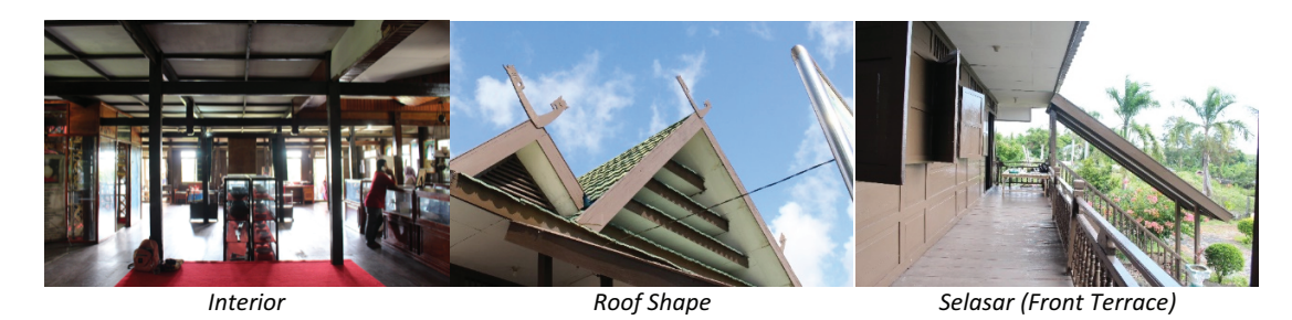
Figure 2: Tanadoang Museum Detail.

The roof of the house is made of bamboo or known as temba roof (split bamboo). In one house usually, use 20,000-30,000 pieces of the copper roof. Also, there are also those who use thatch leaves. The roof section consists of (1) bubungan , (2) timbalajara , and (3) tappi .