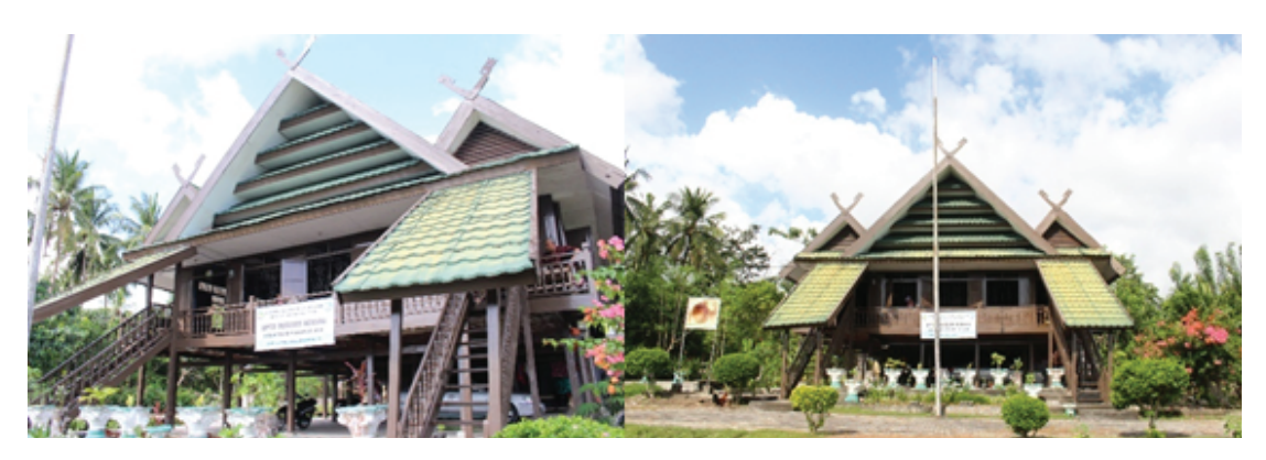
Figure 1: Tanadoang Museum.

built according to the concept of cosmogony, namely the macrocosm and microcosm. Microcosm is divided into three parts, i.e.; (1) the underworld, (2) the middle world, and (3) the upper world (Figure 2).