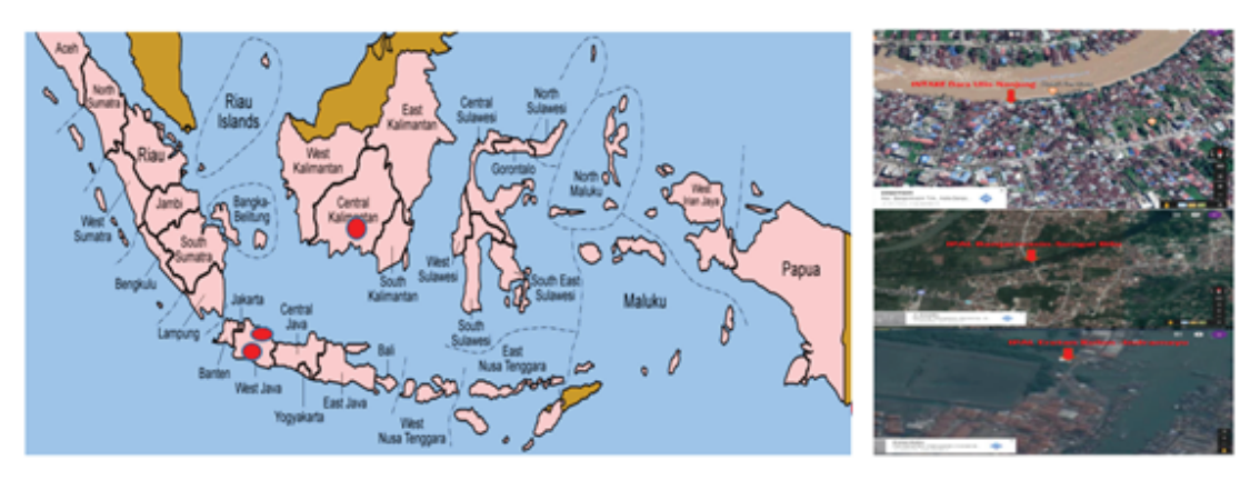
Figure 1: Some specific areas at coastal area, floating and watershed settlement.

Pressure (waste water), State (biophysics) and Impacts (on ecosystem and human health) and Response (target, options, application). The community approach to analyze public perception and motivation were identified through intensive small group discussion and structured observation, both physical and non-physical aspects to support the technology implementation and management.