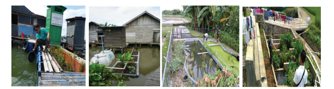
Figure 2: Routine maintenance of biofilter and surface/subsurface constructed wetland in floating settlement, coastal areas and watershed area.

by a natural and ecological method of wastewater treatment. The main wastewater treatment of floating system is anaerobic-semi aerobic biofilter system then further treatment had developed floating wetland. Local government also had developed some communal sanitation built on more stable ground, but the system shall also be adapted with routine flood and has routine desludging or debris collection. In this way, the biofilm system at reactor predicted grows anaerobic, and semi-aerobic created by natural mixing caused float structure. The initial operation uses night soil for seeding to form a microbial attachment. The formation of a biofilm is on two different biofilter media that can adsorb organic compounds over the media. According to Rao, Senthilkumar, Byrne, and Feroz [13], the duration of this adherence phase will depend on several factors: the nature of the support, the surface charge, the nature and the concentration of the feed, etc. The initial surface colonization occurs at the cavities in the inert material, which has a surface roughness favorable for this development. The effluent of this system in a floating settlement - Banjarmasin City for observation one year has the average of BOD less than 30 mg/L from individual treatment applied for 30 households.