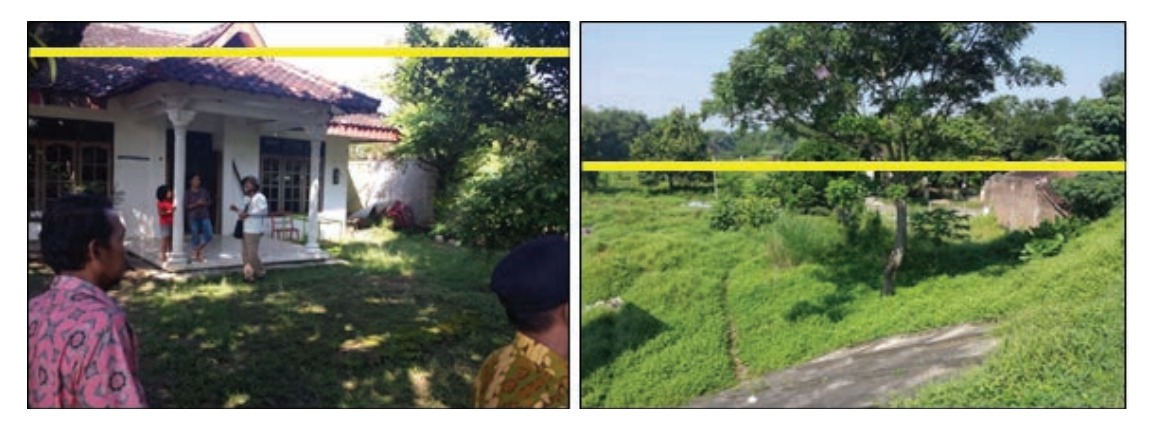
Figure 1: Informal Settlements located on floodplain (yellow line = approximate innundation level in 2007)

without the constant risk of flood [10, 11]. One of these sites is the community of "Pucang Mojo" which is approximately 5 kms from the original floodplain communities and is built well above the highest expected flood stage. See Figures 1 and 2 to compare the original flood-prone site with the resettlement site.