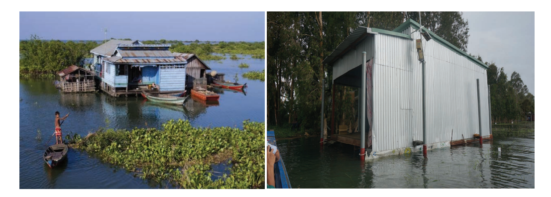
Figure 6: Floating home on Tonle Sap, Cambodia, and Amphibious Home in the Mekong Delta, Vietnam