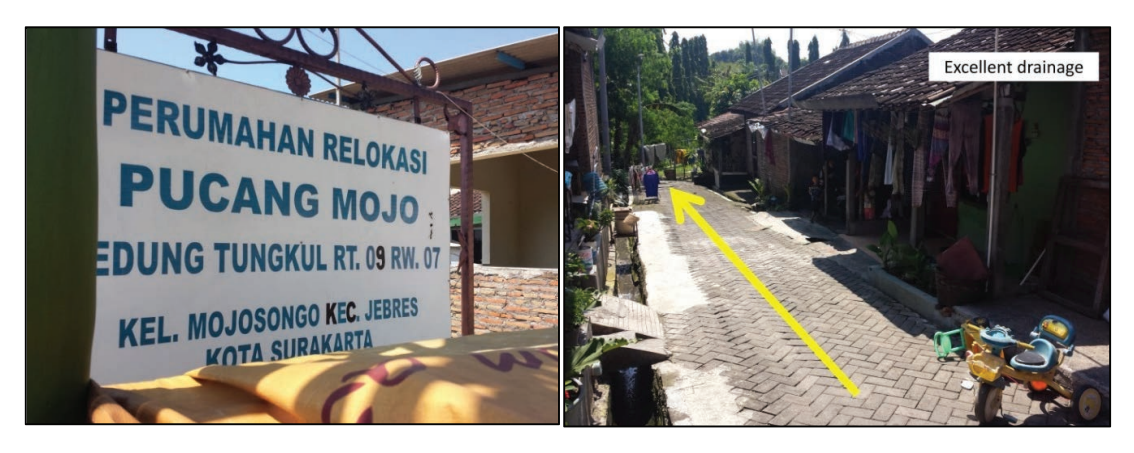
Figure 2: Resettlement community "Pucang Mojo" (approximately 5 kms from original floodplain site)

This case demonstrates that near-site resettlement can work in cases where land is available nearby, where there is political will to fund and coordinate resettlement, and where residents of flood-prone communities are confident that their livelihoods, access to urban amenities and social capital will be preserved in the new resettlement site.