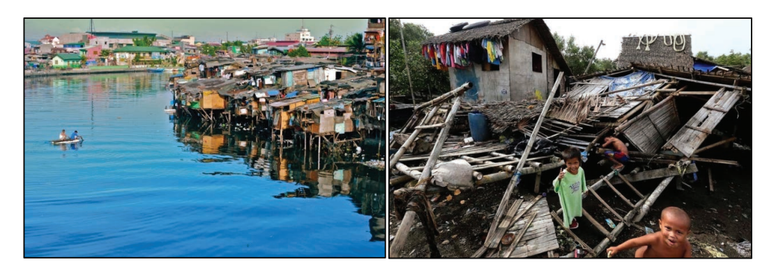
Figure 5: Tondo, Manila Stilt Homes and Stilt Homes Damaged by Typhoon Rammasun (2014)

coastal or lagoonal informal settlements should also consider the option of 'resettling' residents of stilt homes into floating homes (see Figure 6 ), either by retrofitting existing homes with the necessary buoyancy, or by moving residents into new-build floating homes. Floating home approaches are already being explored as possible climate change adaptation strategies in Ho Chi Minh City and Cape Town [8].