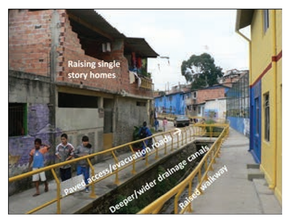
Figure 3: In-situ upgrading for disaster risk reduction and climate change adaptation, Sao Paolo, Brazil

As shown in Figure 3 , the in-situ upgrading process is also an opportunity to address other development needs in the community and often, both hazard and developmentrelated needs can be addressed simultaneously.