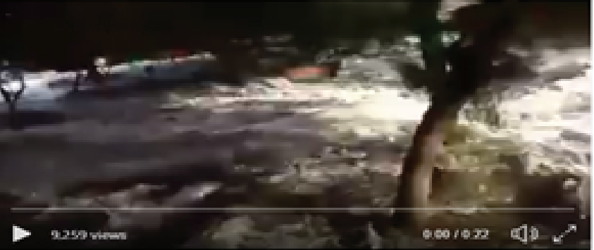
11:48 AM - 25 Jul 2018 from Pantai Parangtritis