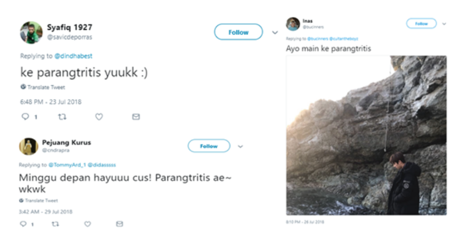
Figure 7: Example of tweets.

Thus, in sentence (2) the user gives the out of topic comment through the metaphor he used containing flirting words. Meanwhile, several tweets containing the willing of going to Parangtritis Beach even before and after disaster. Although this tweet contains positivity, figure (5) is less serious. This is a common phenomenon in social-media like Twitter did. With tweet like figure (5), substantial information is being delivered in a casual way.