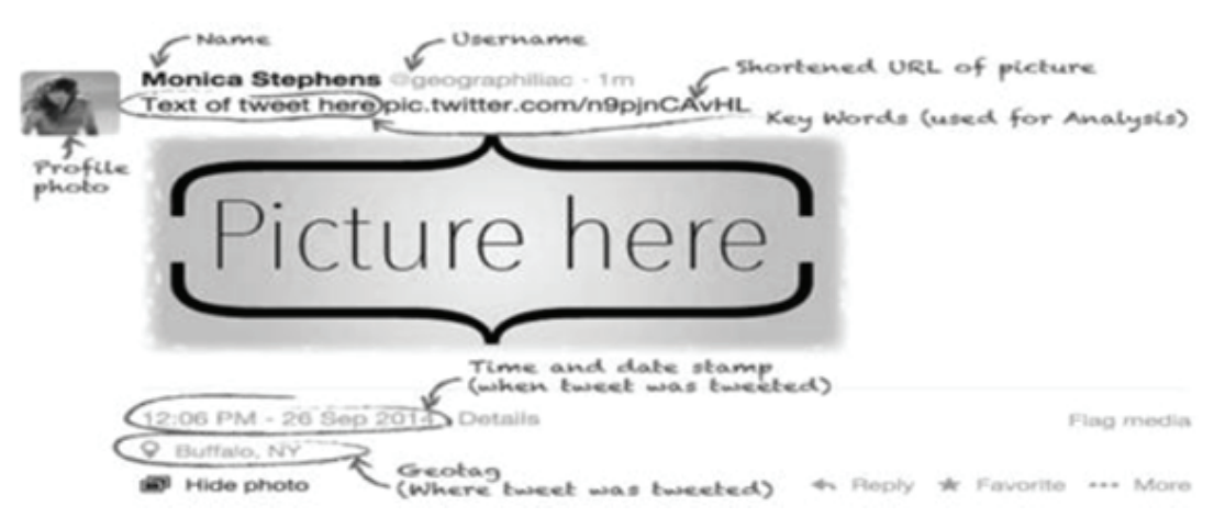
Figure 2: Content Structure of a 'tweet' on Twitter (Poorthuis cited in Kusumo, et al., 2017).

for free from its website Twitter.com (Carley, et al., 2015). Moreover Twitter is not only accessed through website, but it can be downloaded on the smartphone within operating system such as Android and iOS. Twitter Users can post a messages ('tweets') of a maximum of 280 characters per tweet. Twitter serves a hash symbol ('#') before a word which is called a 'hashtag'. A 'hashtag' that is made may become several functions, for example as a conclusion, a label, or a keyword of the post. People can respond another account's post or well-known as a 'tweet' through another 'tweet' if the users want to write a message, a 'retweet', and a 'love' icon to copy the 'tweet'. Those posted tweets occure on their own account and their followers' account timeline. This is following content structure of a 'tweet' or a post.