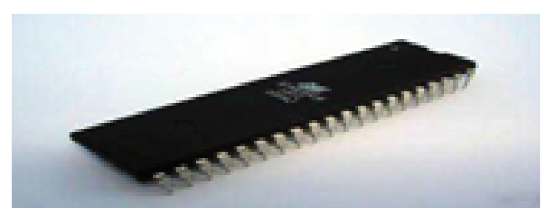
Figure 4: Atmega328P Microcontroller [3].