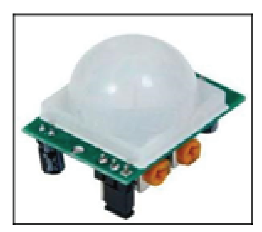
Figure 3: Motion Sensor PIR HC-SR501 [2].