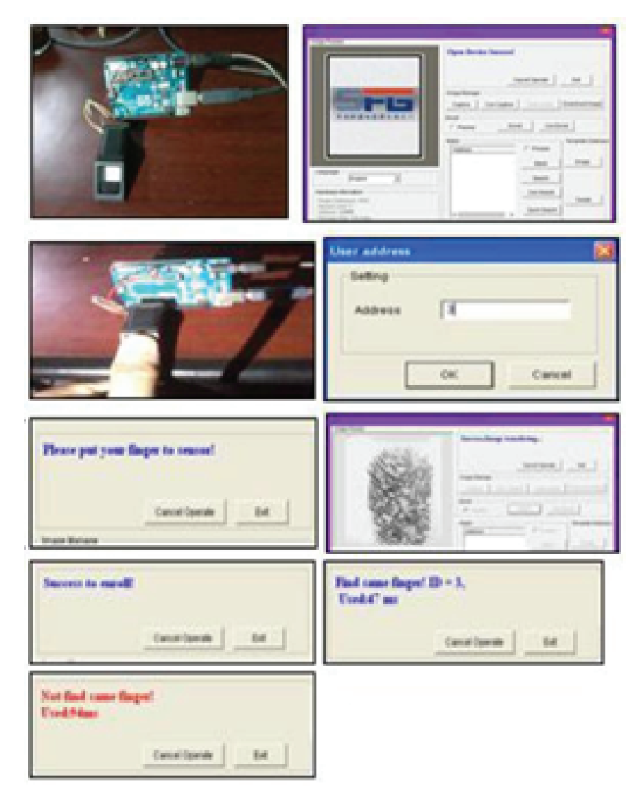
Figure 7: Result of Fingerprint Test.

TABLE 2: Performances of Stepper Motor DC and Door.