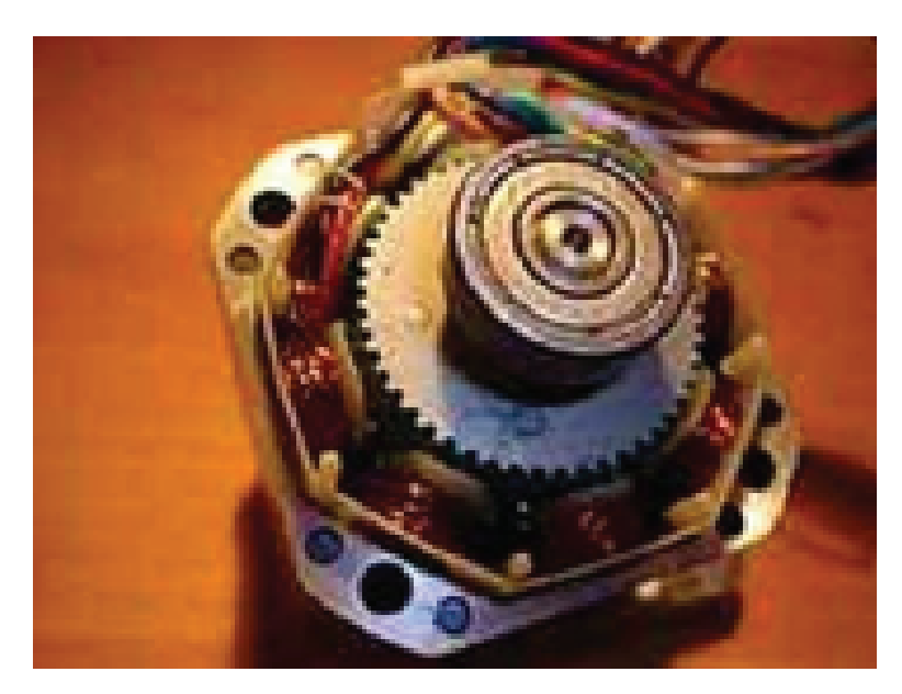
Figure 5: Stepper Motor [4].

Figure 3 describe The Atmega 328P Microcontroller. The Atmega 328P Microcontroller is one type of the Arduino IDE that used which is used Integrated Development Environment (IDE) software. Arduino IDE can be operated by computer berbasis Java dan program C++.