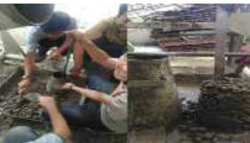
Figure 2: The process of making test specimens until slump testing.