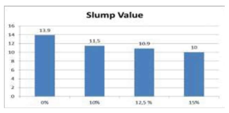
Figure 4: Slump value.

Slump testing is carried out on fresh concrete. Slump test is carried out immediately after mixing the concrete constituent materials, before printing the test object. The planned slump is 12 + 2. The slump test results on fresh concrete in accordance with the plan, can be seen in Figure 4.