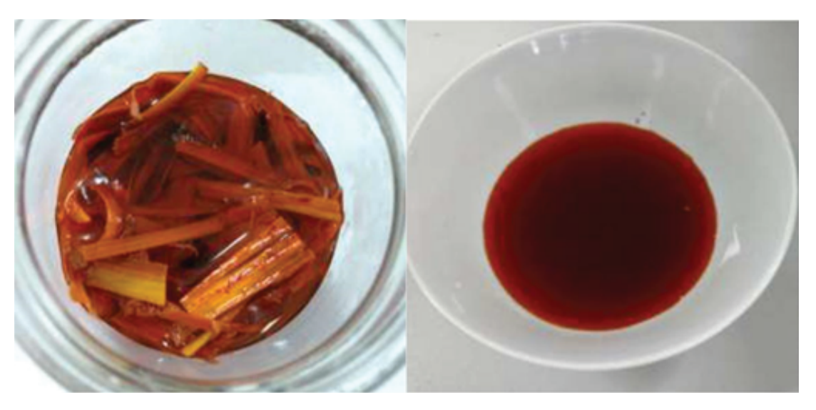
Figure 1: "Secang" wood in water (extraction process in water bath 60°C, 60 min (a) and "secang" wood extract after filtration (b)).

A number of organic compounds are reported by Youstiana and Suhartono (2016), that "secang" wood has a component of a chemical compound essential oils, flavonoids, benzopyran, saponin, brazilin, cisalpine S, cisalpine P, sapanon A, sapanon B. There are types of flavonoids flavones, flavanols and flavanols on extracts of "secang" wood that has been resulted from maceration method and infusion method. Flavonoid content test results showed that the levels of flavonoids in extracts of "secang" wood that has been resulted from the maceration method and infusion methods were 0.0539% and 0.1902%, respectively.