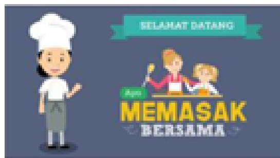
Figure 2: Welcoming Display.