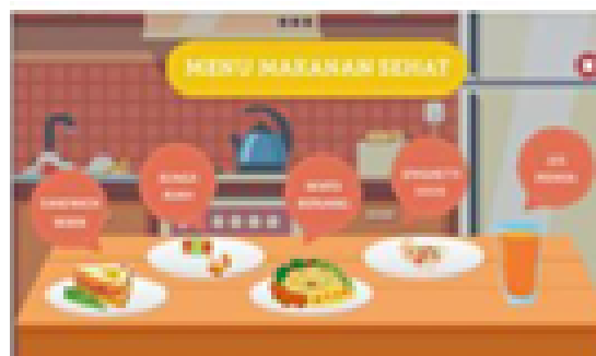
Figure 4: Main Menu Display.