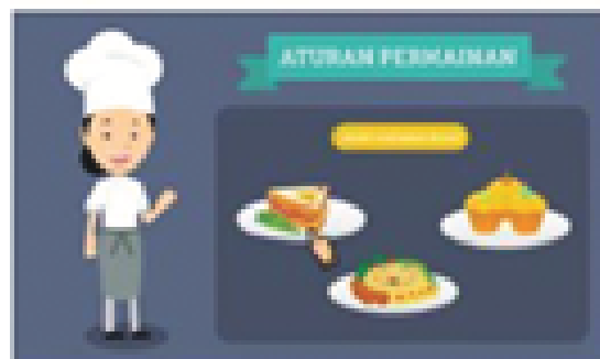
Figure 3: Game Rules Display.