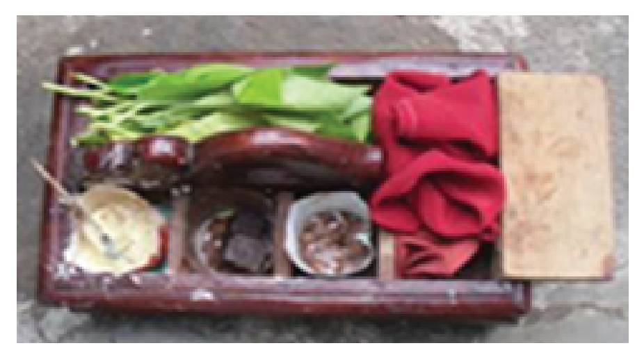
Figure 5: Inang Materials.