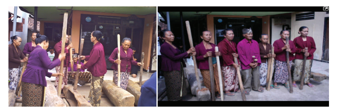
Figure 2: Clothes Gedogan music players.