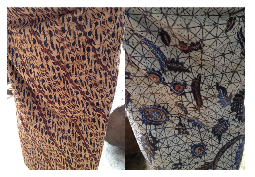
Figure 3: Batik typical Osing.

for udeng at a young age that looks like a horn on the right left is longer that has meaning that a young age can achieve the ideals / wishes in the future is still long. While udeng for old age or have a family shape hammer like a horn on the right of the left is shorter than the young age, from the meaning of symbols contained that old age is more humbling and more grateful than has been obtained.