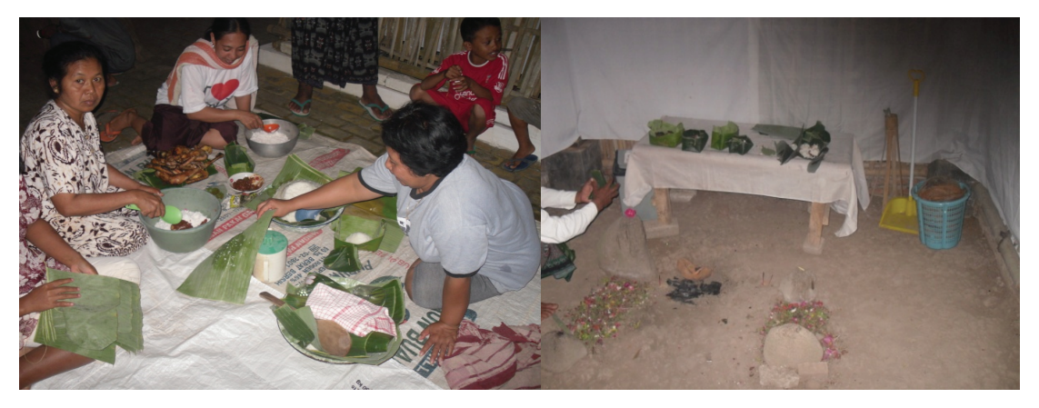
Figure 1: Sesajen and fragrance for buyut cili ritual.

someone come with a group of people other than banyuwangi residents who come to know gedhogan music, Kemiren village residents offer offerings to buyut cili through selamatan ceremony. This slametan has symbols with the meaning of pleading for the salvation of all executors. Expectations of a more brilliant future, and to gain God's approval. So they are afraid to abandon this activity because it has become their belief that leaving this tradition and breaking will not get a blessing. In addition, there are also conditions in the ritual buyut cili include: (a) Non-alcoholic fragrances in the form of incense, coconut skin and flowers for being a source of fragrance that is free of alcohol so that it signifies purity, (b) For the offerings used chicken both male and female chickens that have never been mated, which became the belief of the community around that the chickens have the meaning of purity and still clean.