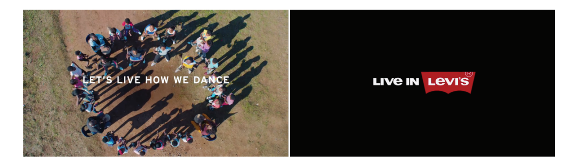
Figure 3: Ending sequence from Levi's "Circle" (2017).

cultural, geographic, and demographic backgrounds as well as their individuality seen in their dancing styles and appearance serve as a background that seems to suggest that those differences matter less than being able to express themselves through dancing.