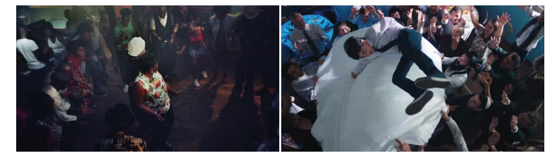
Figure 2: Follow up scenes from Levi's "Circle" (2017).

As the viewers are purposefully made curious to see what the woman is about to do next, the sequence cuts abruptly to show a scene featuring a young, tall, Caucasian man wearing a denim jacket walking down a flat of stairs and heading into something or somewhere, which the audience is yet to find out. Then the sequence cuts abruptly again to show a scene from a Bar Mitzvah and a bearded Jewish man in his 20s or 30s walking towards the front of the crowd. At this point, the sequence continues with several scenes of a person in different settings seen walking towards a group already forming a circle that can be described as celebratory, jovial, or fun. After 17 seconds of teasing the viewers with the concept of a 'dance circle', the sequence continues with a scene of the woman from the first sequence pushing her way through a crowd and beginning to dance in the centre of the circle, first by herself and then with a middle-aged man wearing a white hat. Following this scene, the ad continues with several sequence showing people dancing in circles with one or several individuals dancing in the centre. The groups shown in the dance circles are diverse in terms of gender, race, culture, age, scene, appearance, dance style-yet they all share one thing in common, i.e. they are dancing merrily and they all seem to be having a great time (Figure 2).