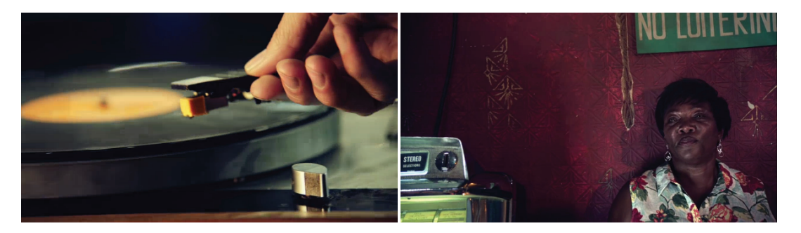
Figure 1: First five-second teaser of Levi's "Circle" (2017).

August 2017. The ad opens up its five-second teaser with a sequence of a turntable being started and playing vinyl record on a turntable, which can be simultaneously seen as something nostalgic and current. This is in line with the assertion that vinyl record is making a comeback in the form of commemoration, connoisseurship of a cultural movement (Long, 2017). Then the sequence continues with an Afro-influenced dance beat in the background followed by an image of a middle-aged woman standing against the wall (Figure 1).