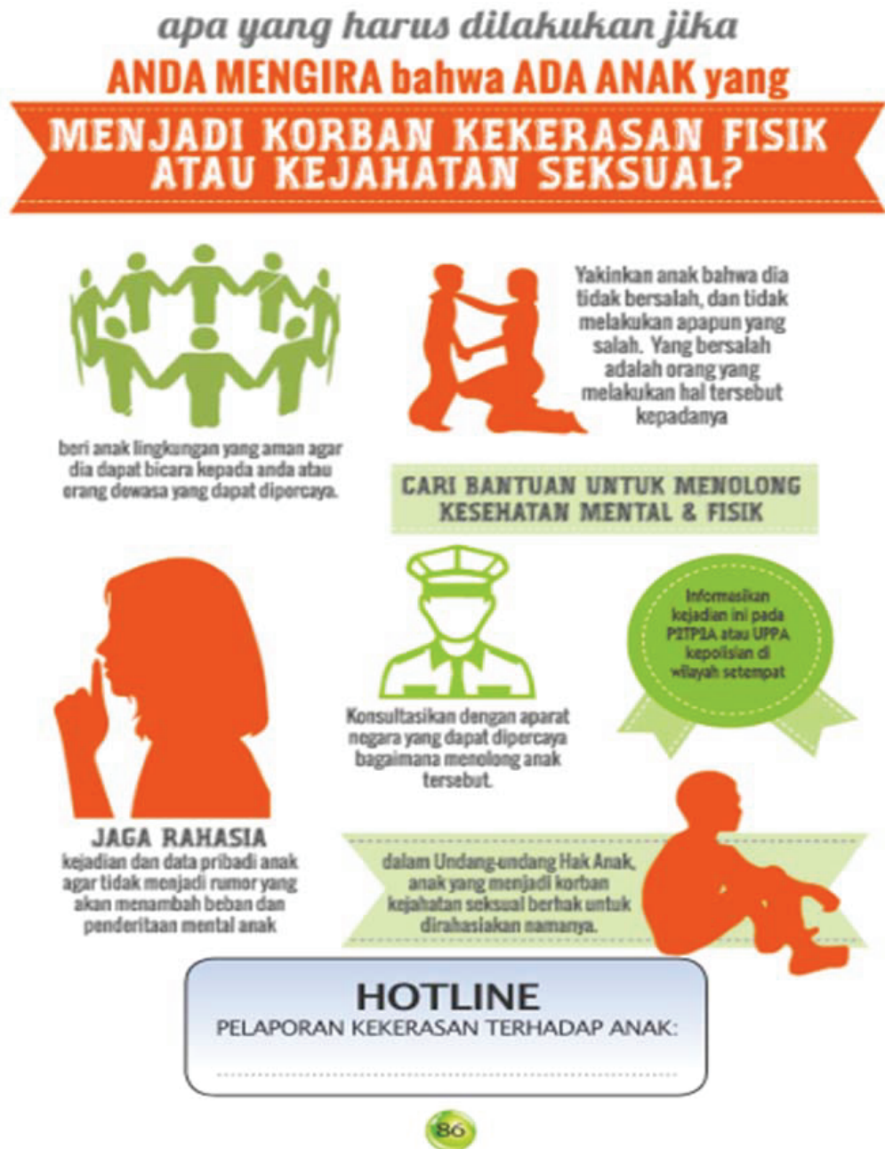
Figure 4: Preventing sexual abuse for parenting skills in Mother and Child Health books. (Source: Health Ministry Republik Indonesia (2016, p. 86)).

education for children of parents do not constitute part of the parenting process that requires the attention of the parents of the child since the age of early, particularly in creating a two-way communication. Thus, if the child was a teenager, the parents are ready to communicate with the child according to his needs.