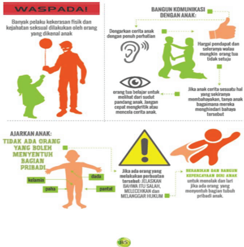
Figure 3: Sex Education for Parent in Mother and Child Health books.

of the body, splitting the beds between girls and boys, regulations upon entering the room parents, and so forth [24]. Religious Education can also be synchronized with social customs and traditions that exist in the province, who often use culture Merariq time to marry his daughter.