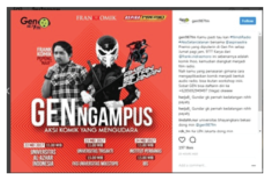
Figure 2: Integrated Off-air, on-air program and Instagram.

media crosshairs the listener will forget where and when it will be held its activities. Therefore they also create similar messages in Instagram as seen in Figure 2.