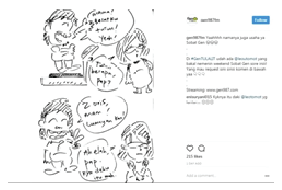
Figure 6: Message in Instagram.