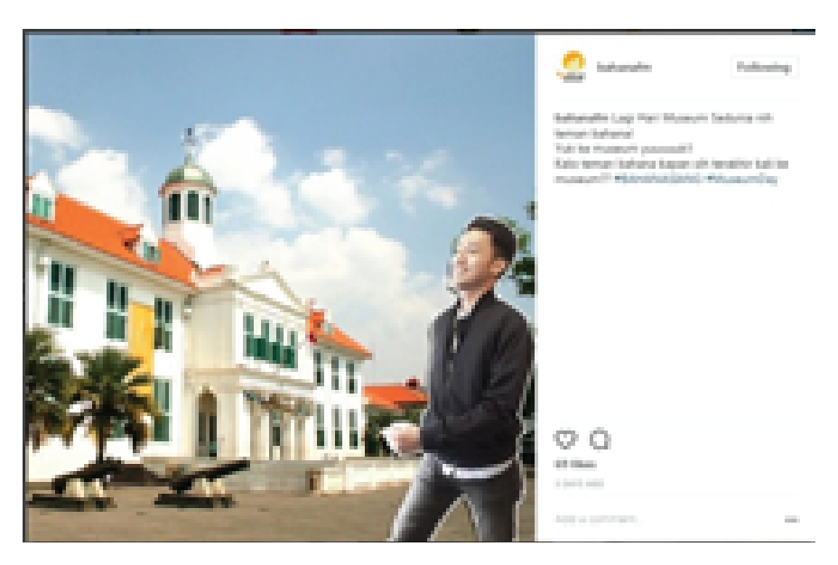
Figure 1: Instagram message integrated with on-air program.

On Thursday, May 18, 2017 is the day of the International Museum, where the National Museum makes an event that when people visiting the National Museum in that day will be free of charge. In order for many people who are interested in the program and go to the national museum then made also a graphic image as a promotion in Instagram such as in Figure 1.