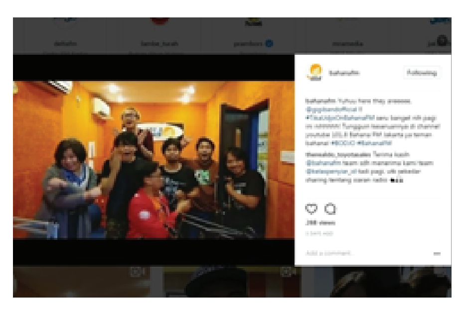
Figure 4: Integrated on-air program, Instagram, and YouTube.