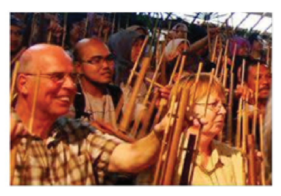
Figure 2: The audience are enthusiastic to play the Angklung Music.

middle with his left hand. The right hand holds the bottom angklung, angklung shake it will sound a melodious of two tubes angklung. The method used by the leadership to play the angklung in bulk is by using the Hand sign and read notation numbers written on the front of the stage.