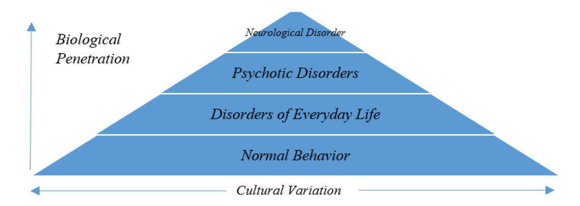
Figure 1: Cultural variations in mental disorders as a function of biological penetration and behavioral plasticity [20].

Cultural factors have been demonstrated to influence and shape mental disorders through a number of factors [22]: