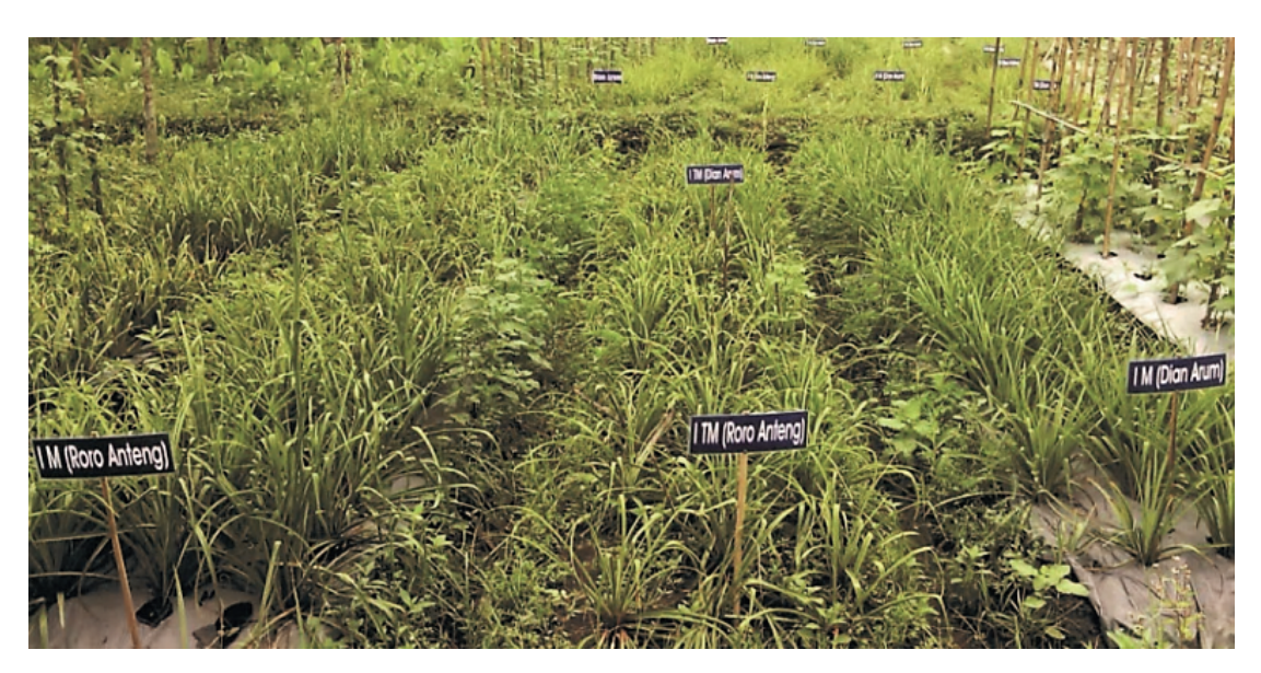
Figure 1: Performance of plant growth with and without mulch.

or 3 weeks after planting ages, the plants were fertilized by 300 kg NPK /ha which were repeated every 6 months, while the manure was reapplied every 3-4 months. The provision of watering and weeding was carried out as needed.