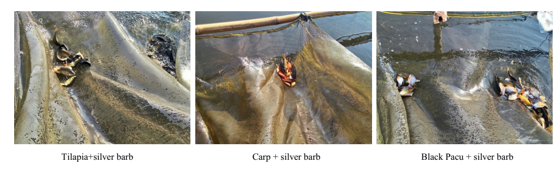
Figure 3: Net cage condition at the end of the research.

495% meanwhile not aerated ones growth only 130% after 35 cultured days [19]. Table 3 shows that water quality parameters of water quality in the range of optimal except dissolved oxygen.