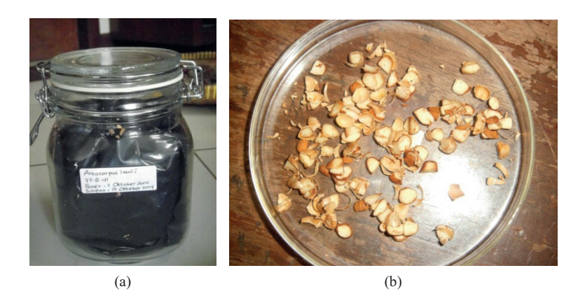
Figure 1: (a) Glass jar containing moss media; (b) Slice of A. lowii seeds.

in the Seeds Bank's greenhouse, Center for Plant Conservation Botanical Gardens—LIPI in October 2014 until December 2014.