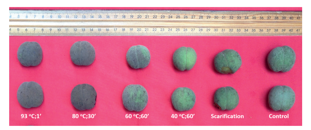
Figure 3: The discoloration of Brownlowia peltata fruit after hot water immersion treatments.

otherwise, another hot water immersion treatment of 93°C for one minute lowered the fruit moisture content up to 1.56% became 62.44%. A decreasing percentage of fruit weight possibly caused by plasmolysis of pericarp cell were damaged due to high temperature. The higher the temperature of the water led discoloration of the outer husk became more brownish and blackened. Figure 3 shows the discoloration of the outer husk after hot water immersion treatments.