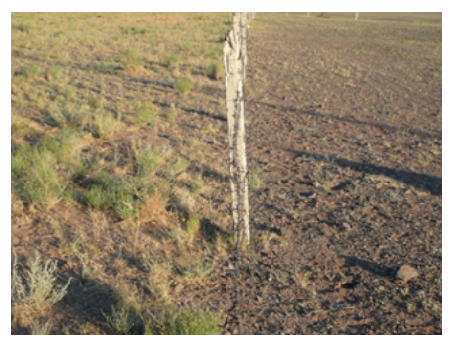
Figure 1: Photo of site A4 illustrating the studied areas excluding grazing (to the left of the fence) and with intensive grazing (to the right of the fence).