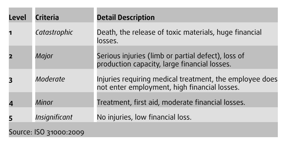
TABLE 2: The assessment of consequence level.