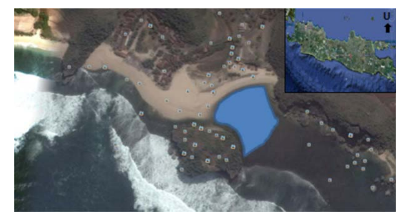
Figure 1. The study site, intertidal zone of Drini Beach, Gunungkidul

Description: Pi = covered species i (%) ai = the total cover species i (%) A = the total area covered macroalga (%)