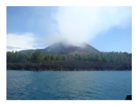
Figure 2. Anak Krakatau island