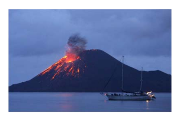
Figure 3. Anak Krakatau eruption September, 2012