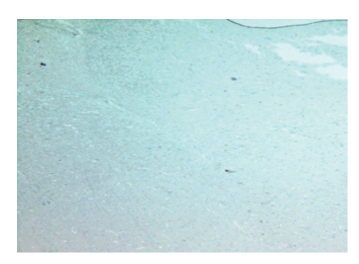
Figure 1: The Brain of the laying hen with clinical signs of torticollis and curled toe paralysis (negative). Immunohistochemistry streptavidin biotin negative, no brown discoloration (Streptavidin biotin, 250x.).