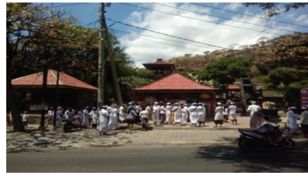
PULAKI : Suasana di kawasan Pura Pulaki, di Desa Banyupoh, Kecamatan Gerokgak, yang mulai ramai dikunjungi pamedek.