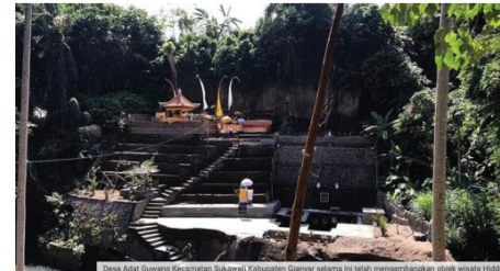
Desa Adat Guwang Kecamatan Sukamati Kabupaten Gianyar selama ini telah mengembangkan objek wisata Hidden Canyon.