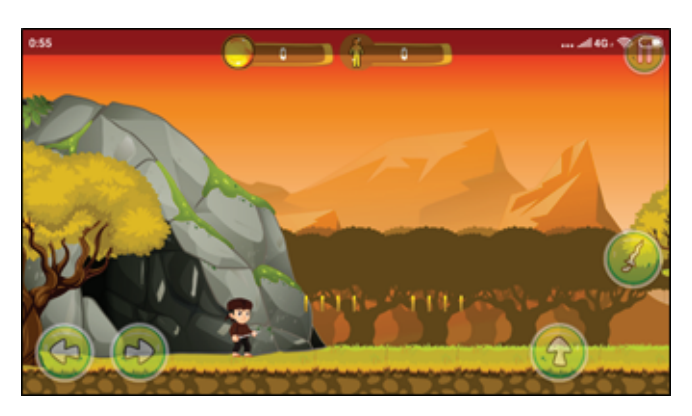
Figure 5: Medium level of Game Panjol