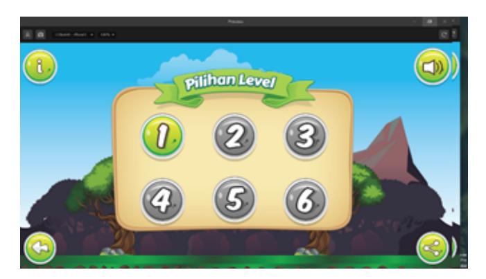
Figure 1: Level Selection

The game of Panjol consists six levels. At the odd level, namely the first level, third level, and fifth level, there are material on the diversity of othnic groups and cultures which are equipped with quizzes that must be answered in order to unlock the next level. While at the even level, namely the second level, fourth level, and sixth level are an adventure-based game with a rescue mission. On this mission, the values taught are rukun and tulung-tinulung [9]. The level selection image in the Panjol game can be seen in Figure 1