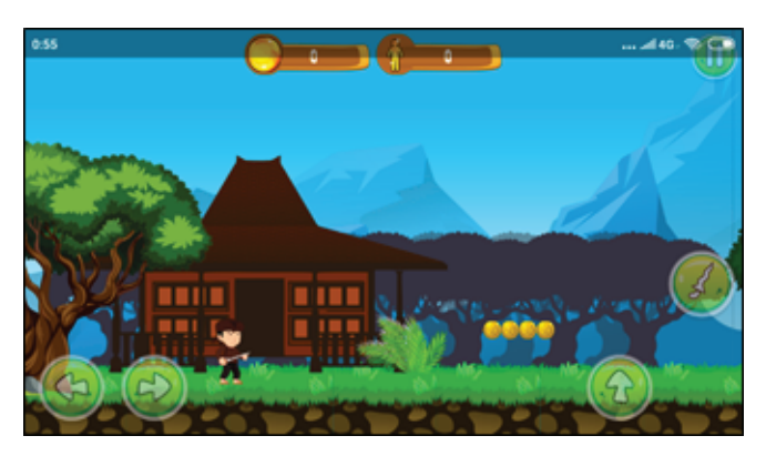
Figure 4: Easy level of Game Panjol

a. Easy Level: At this level, the adventure starts from the yard of the main character's house, Panjol, against the background of a Javanese traditional house during the daytime. The page level display is easily indicated on Figure 4.