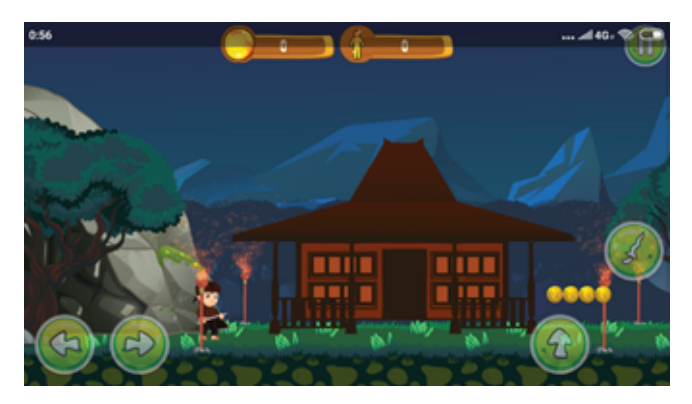
Figure 6: Hard level of Game Panjol

categories with different weights. Obstacles in the form of nature, are consisting of rivers, ravines, mud, and shooting stars. Obstacles in the form of wild animals consist of birds, ferrets, and wolves. Obstacles from enemies in the form of humans are divided into two types, namely enemy 1 is rather dangerous and enemy 2 is very dangerous. Man-made obstacles are in the form of spears, bullets and prisons. Table 1, 2, and 3 show obstacles at easy, medium, and hard levels.