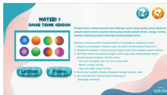
Figure 2: interactive digital module material display

Each section in the interactive digital illustration module is made with the same concept, namely coloring activities but with different illustrations in each section. The different illustrations in each section aim to provide new nuances in learning, so that students don't get bored easily. This part of the illustration is made simpler, there is a title made with a large size that serves as a guide. The button illustration is colored blue with a caption in it, the button is made to stand out or 3D by adding a dark light to the illustration. Furthermore, the presentation of the material that focuses on the explanation contains a lot of text as follows: