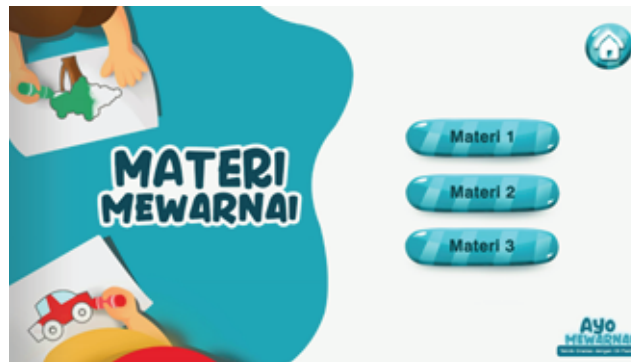
Figure 1: interactive digital module subsections

used by the age of the children. The illustrations that are made as attractive as possible will indirectly increase students' interest in exploring the contents of the interactive digital module. Characteristics of junior high school students at this stage prefer to play and explore interesting things[7]. The illustration shown has the concept of coloring activities, so that each sheet will display the same theme.