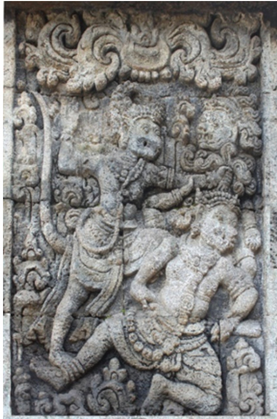
Figure 1: Hanoman fighting giants

on Sala Chalermkrung Royal Theater in Bangkok City, Thailand. After the show, it was realized that the play of Ramayana stories in Thailand is called Ramakien . The show plays many scenes but all are centralized on one dominant character, which is, Hanoman. Therefore, it is not surprising if the scenes are about the romance life of Hanoman and fish princess or the encounter of Hanoman with mystical women. Second visit in Thailand was to a candi named Wat Arun . This candi is dominated by Hanoman characters depicted spectacularly. Hanoman is not described narratively in a set of story episodes, but he is expressed in a lot of figurations from the base to the summit. This arrangement gives a great monumental impression to Hanoman character.