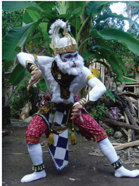
Figure 3: Hanoman character in human puppet version of Surakarta style

Symbolical aspect that constitute Hanoman character aesthetics can be understood through paradigmatic and syntagmatic frameworks. Ramayana stories or Ramakien are similarly profiling Hanoman as “monkey” but with divine nature. Besides monkey, Hindu mythology also mentions many divine animals such as cow, peacock, elephant, horse, dragon, and others [15]. Hanoman character is played by performers wearing “mask”, and this arrangement is analyzed through relational triangle as following: