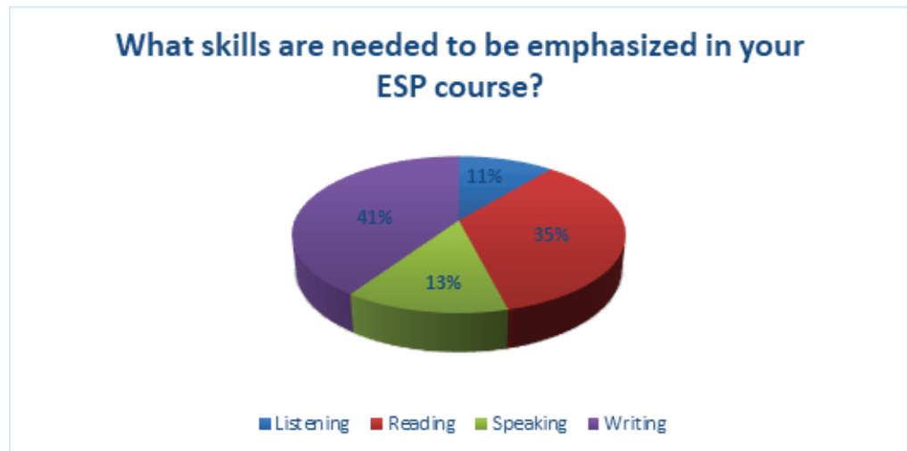
Figure 3: Students' perception of skills needed to be emphasized in ESP Course

(14%) considered speaking skills to be emphasized while 22 students (11%) thought that listening skill should be highlighted in their ESP course. From the findings, it can be seen that reading and writing skills are the most important skills needed to be emphasized in their current ESP course.