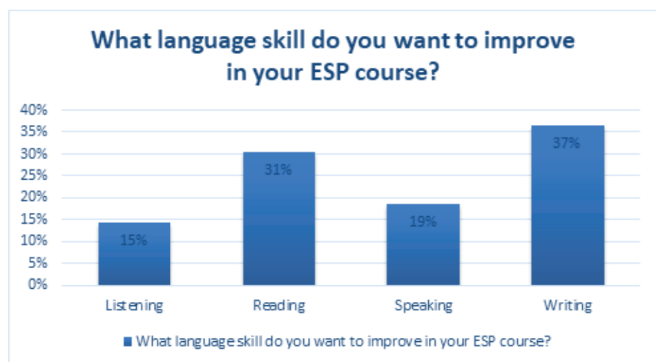
Figure 1: Learning preferences in terms of language skills

The second part of the online survey was used to retrieve information related to students' perceived language skill needs, including their perception of the current ESP course. The result of data analysis reveals that most students need reading and writing skills more than any other skills. The data gained from students' responses toward "learning preferences in terms of language skills" (Khan, 2007). In the questionnaire, the participants were asked about the language skills they want to improve during their ESP course. Figure 1 shows the students' responses towards students' needs of language skills.