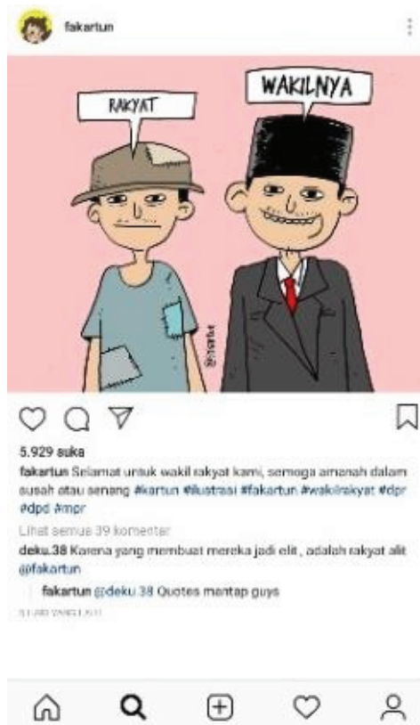
Figure 2: Meme about DPR and People.

DPR. The meme is connoted as a picture of the current political reality. This is based on that the DPR as a people's representative, has the obligation to improve the people's welfare, accommodate and follow up on people's aspirations and complaints. In this case, it means that the DPR is ready to serve the people. However, in the meme above, the opposite is actually described, the man with the shabby clothes become helpless and he has to serve the man with the tie. The man with the tie does not seem to care about the man with the shabby clothes. These signified and signifier rise new signs of disappointments. It is reflected on the face of the man with the shabby clothes towards the man with tie as their representatives. These signified and signifier then become a myth that emerges from an agreement on cultural values which can then develop into general assumptions.