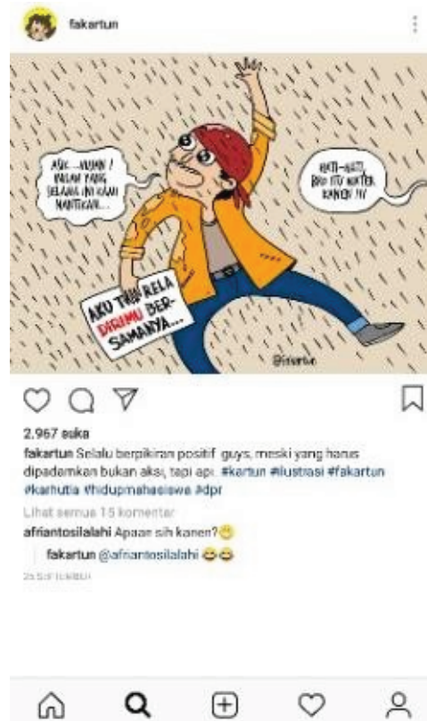
Figure 3: Meme about the Water Cannon.

wishes of their superiors, in this case their representatives. The meme represents the people’s disappointment with the performance of the DPR who are obliged to protect and accept the aspirations of the people.