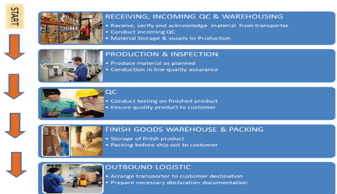
Figure 1: Supply Chain and Operation Management learning factory process flow.

packing/logistic processes which simulate a continuous flow of a hand dryer assembly processes. The learning factory aims at introducing the Faculty of Industrial Management undergraduate's students about the broad spectrum of manufacturing supply chain and operation management processes from part receiving, material storage, assembly process, quality control, packing and delivery of good. Figure 1 shows the diversity of activities that take place in the learning factory.