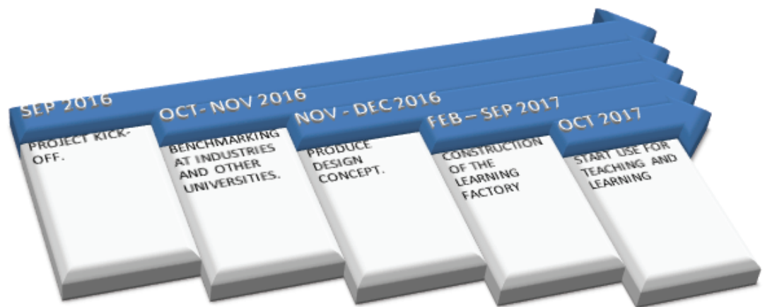
Figure 4: Milestone of the Learning Factory Establishment.

realization based on the design made using the solid work software. Figure 5 shows the framework used to conduct the activities in the learning factory