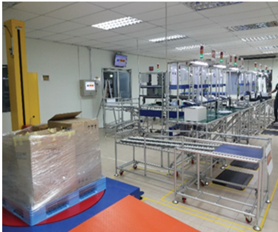
Figure 2: Photo of the Learning Factory Assembly Line.

and flexible overhead wiring system. Figure 3 shows various equipment installed in the learning factory