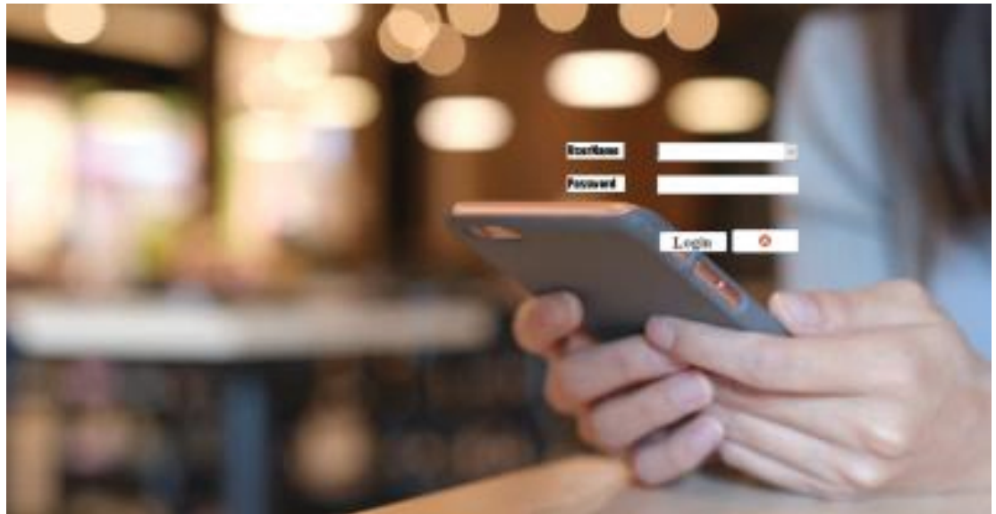
Figure 2: Menus for Login in E-Agenda System.