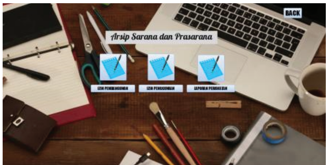
Figure 7: Menu of Facilities/Infrastructure Archive.

rejected, so there is a difference between the responses of the respondents before with after development of the model. If based on the magnitude of the numbers significance, then numbers of significance is 0.05 < 0.00 . It means that the null hypothesis was rejected. Based on the hypothesis can be defined that there is a difference in valuation of the respondent before and after the development of the model. Position T table and T count on the curve can be seen in Figure 9.