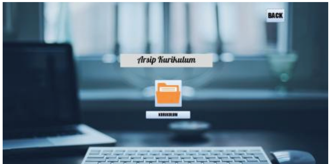
Figure 4: Menu of Curriculum archive.