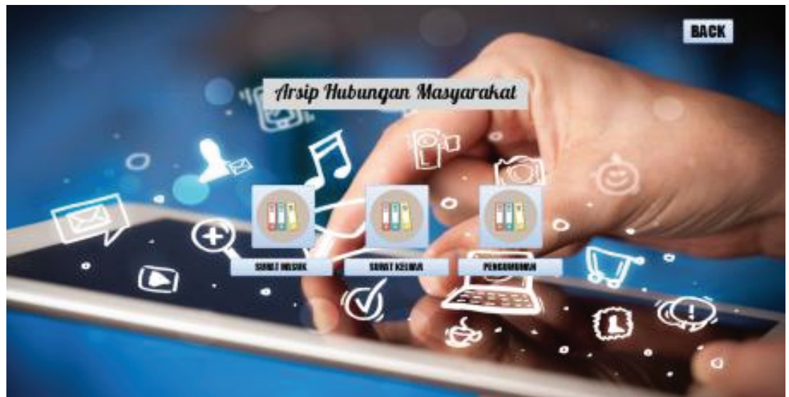
Figure 8: Display of Public relations Archive Menu.