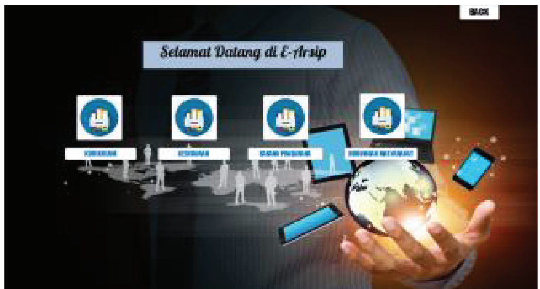
Figure 3: Menu of E-Agenda System for school archive.

In the menu of curriculum archive, there is only one menu about all kinds of document relating to the areas of the curriculum. The appearance of sub menu from curriculum archive can be seen in Figure 5.