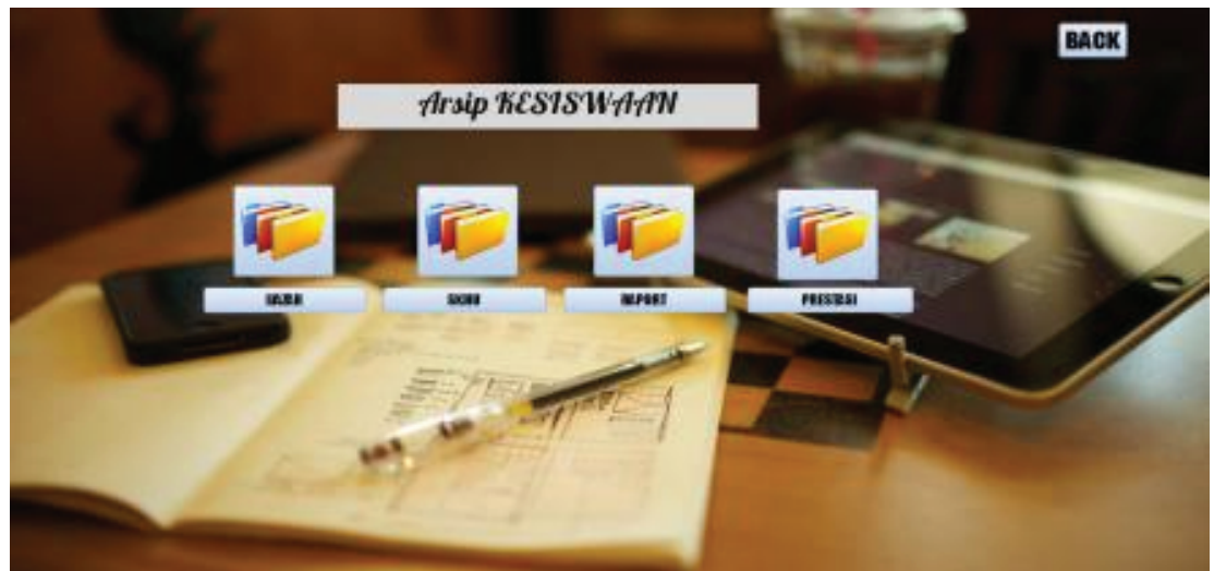
Figure 6: Menu of student affair archive.