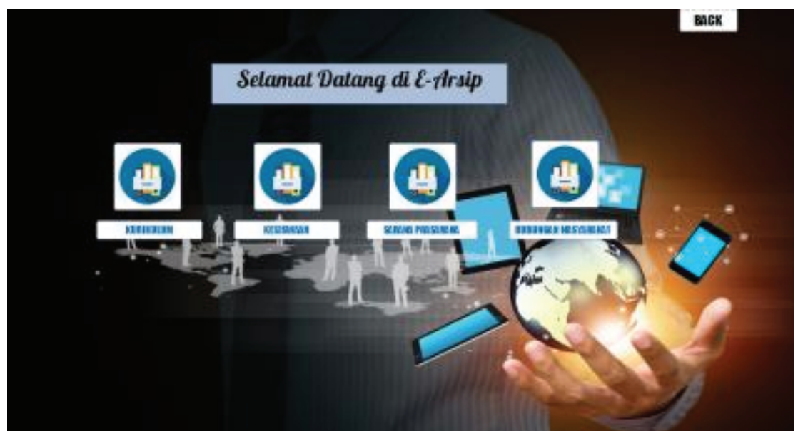
Figure 1: First Menu of E-Agenda.

The system developed is E-Agenda system based on Ms Access program. Ms Access program that had more utilized for inventory logistics, but this study will be developing for E-Agenda system in recording the archive at school. This system is simple and easy to be applied. E- Agenda system designed by dividing into four menus, namely curriculum, facilities, students, and public relations. The details of the menus as in Figure 1.