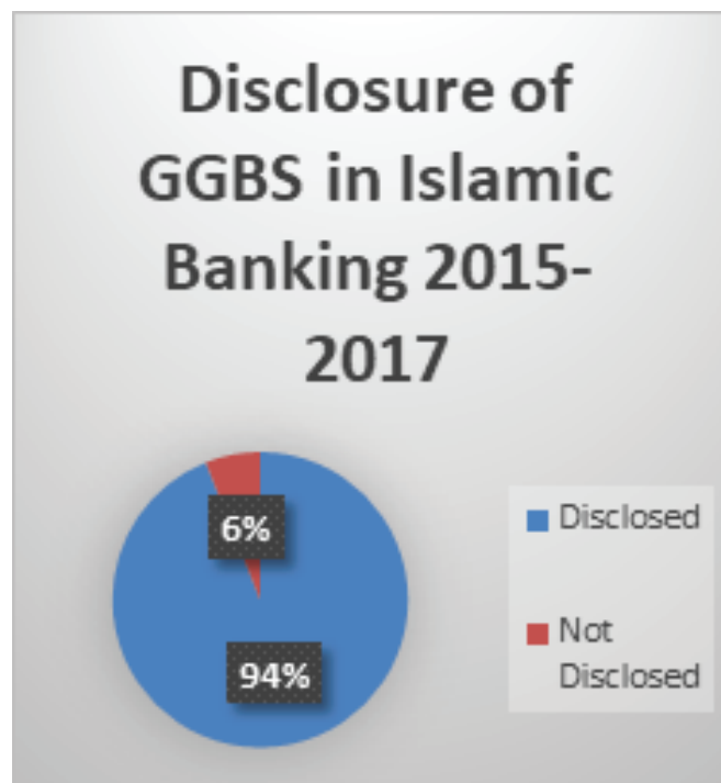
Figure 2: GGBS Disclosure and not Disclosure 2015-2017.

The 3 items can not be found in Bank Shariah Annual Report. The 3 items are (1) aspects of GGBS that have not been implemented along with the reasons,, (2) Transaction between two or more parties that have a gap of interest, (3) implementing of obudsman function. The first, aspects of GGBS that have not been implemented along with the reasons. BUS are not disclosing about the aspect of GGBS that have not been implemented along with the reasons in their annual report. It is caused by the competition in banking sector is getting tougher. Each bank competes to show good GGBS, because GGBS is a strategy to attract customer. That's why BUS are not disclosing their aspects of GGBS that have not been implemented along with the reasons.