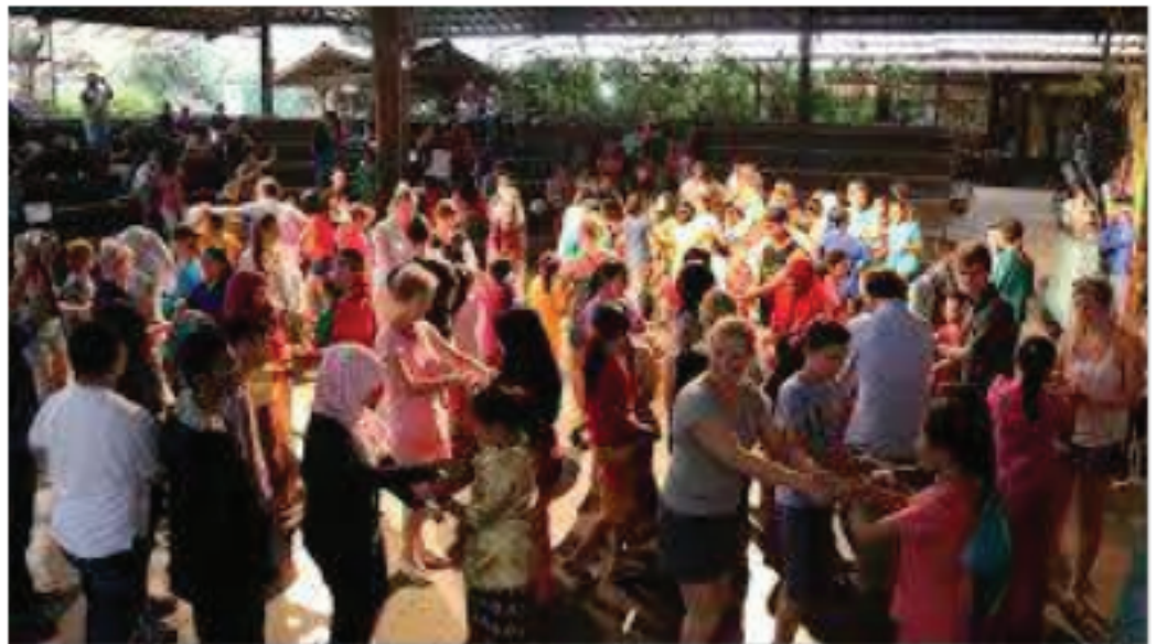
Figure 3: Visitors and SAU's artist dance together.

At the end of the show, the performers will go again to the stage and invites visitors (all audience) to have fun and dance together. This is the end of a whole series of performances at SAU (Figure 3). All the children go to the stage, each took one of the spectators at random to be invited to dance along. First the audience are invited to play a very long serpent, circling the stage, after which the audience dancing along as directed by children. At the same time MC closed the ceremony.