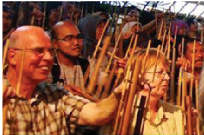
Figure 2: The audience are enthusiastic to play the Angklung Music.

middle with his left hand. The right hand holds the bottom angklung, angklung shake it will sound a melodious of two tubes angklung. The method used by the leadership to play the angklung in bulk is by using the Hand sign and read notation numbers written on the front of the stage.