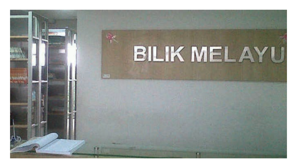
Figure 3: Front desk of Bilik Melayu.