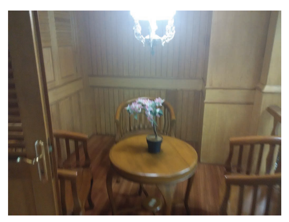
Figure 2: Jakarta Special Collection corner image.