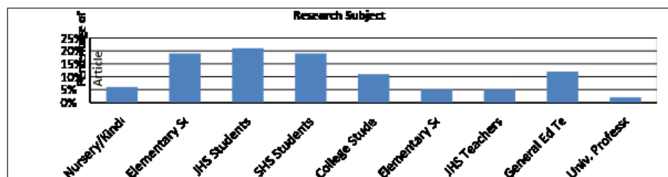
Figure 2: The classification based on research subject.

The next classification is based on the research subject. Research subjects consist of students, as in nursery/kindergarten, elementary school, junior high school, senior high school, college students; and teachers, such as elementary school, junior high school, senior high school, general education teachers, and university professors. The results of the research subject classification are shown in Figure 2 below.