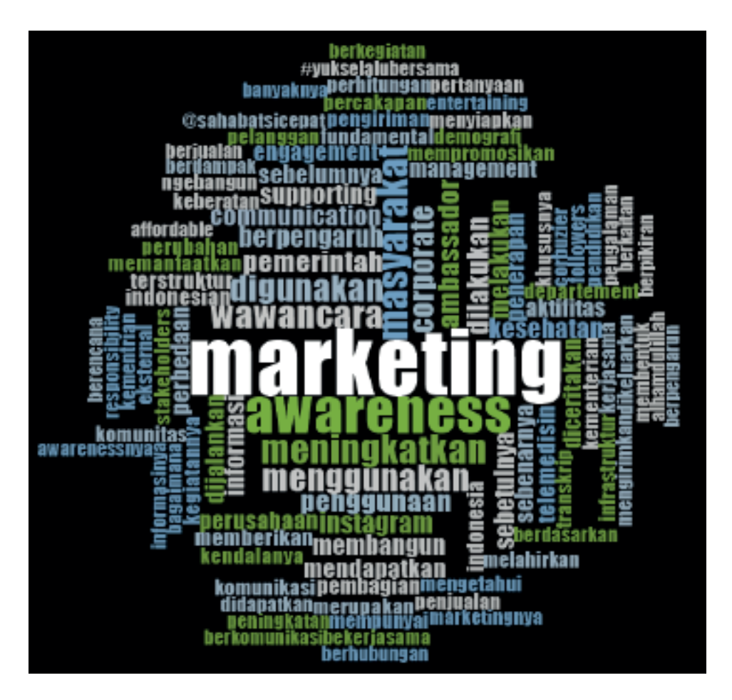
Figure 1: Word frequency.