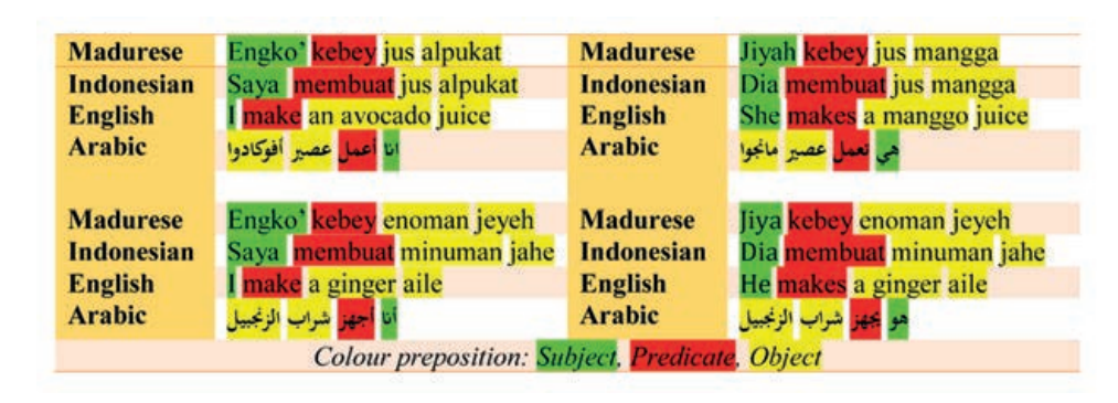
Figure 2: Madurese-Indonesian-English-Arabic Orthographical-phonological-typological ICC-SVR.

Madurese-Indonesian-NL, along with a small proportion of English-Arabic-L2 exposure. All scholars were participating publicly in a private high institution in Probolinggo, where the daily instruction language is Indonesian, & were receiving English-Arabic-L2 instruction through intensive language programs. The language syllabus instruction was English-Arabic simultaneously by administering a novel-kind methodology of Madurese-Indonesian-English-Arabic orthographical-phonological-typological ICC-SVR approach but the scholar received 180 minutes per edification process during the overall edification process. All scholars had received a formal course in both English and Arabic for a minimum period of at least minimum from the first to the third semester of their regular non-English-Arabic major study.