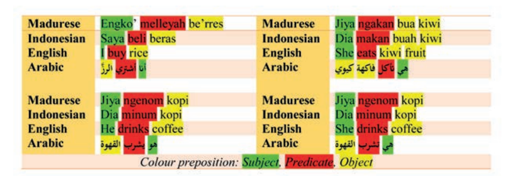
Figure 1: Madurese-Indonesian-English-Arabic Orthographical-phonological-typological ICC-SVR.