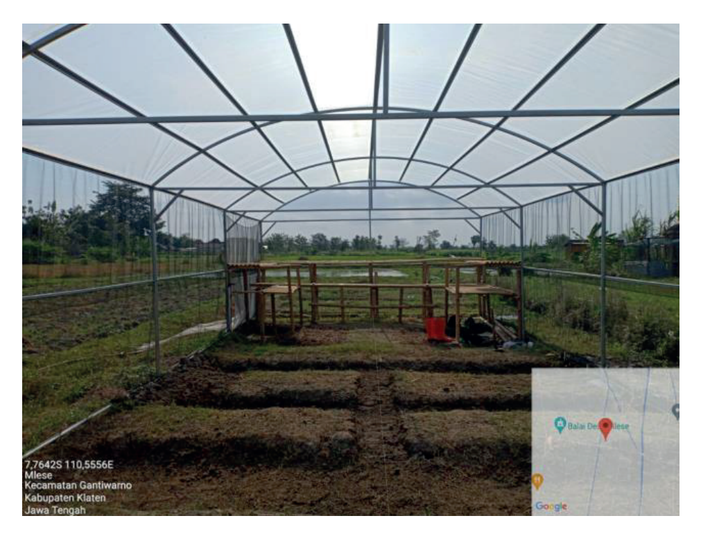
Figure 3: The Temporary Progress of the Green House Construction in Mlese Village.