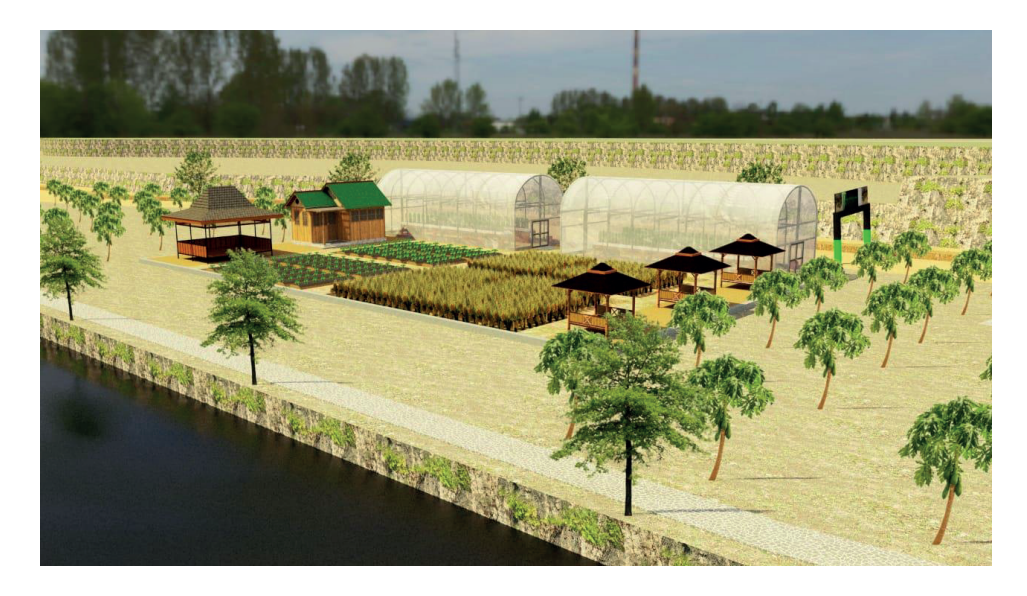
Figure 5: Sketch of Green House in Mlese Village, Klaten Regency.

small part of the efforts that can be made. There are still many things that are needed by the village community, especially in Mlese Village, Gantiwarno District, Klaten Regency.