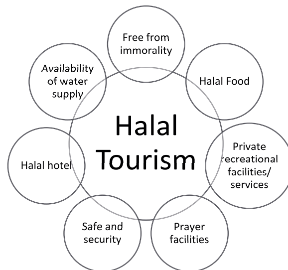
Figure 1: Characteristics of Halal Tourism.

In addition, the basics need that are prioritized to be met in halal tourism are closely related to their worship activities. At least six basic needs that Muslims need in their daily lives including when doing tourist activities [17, 18]. These basic needs include the need for purification facilities with water, facilities for worship (salat), halal food, and tourism activities that do not conflict with Islamic values such as no element of immorality and evil, Ramadan services, and recreational facilities/services with privacy. Figure 1 summarizes the characteristics of halal tourism.