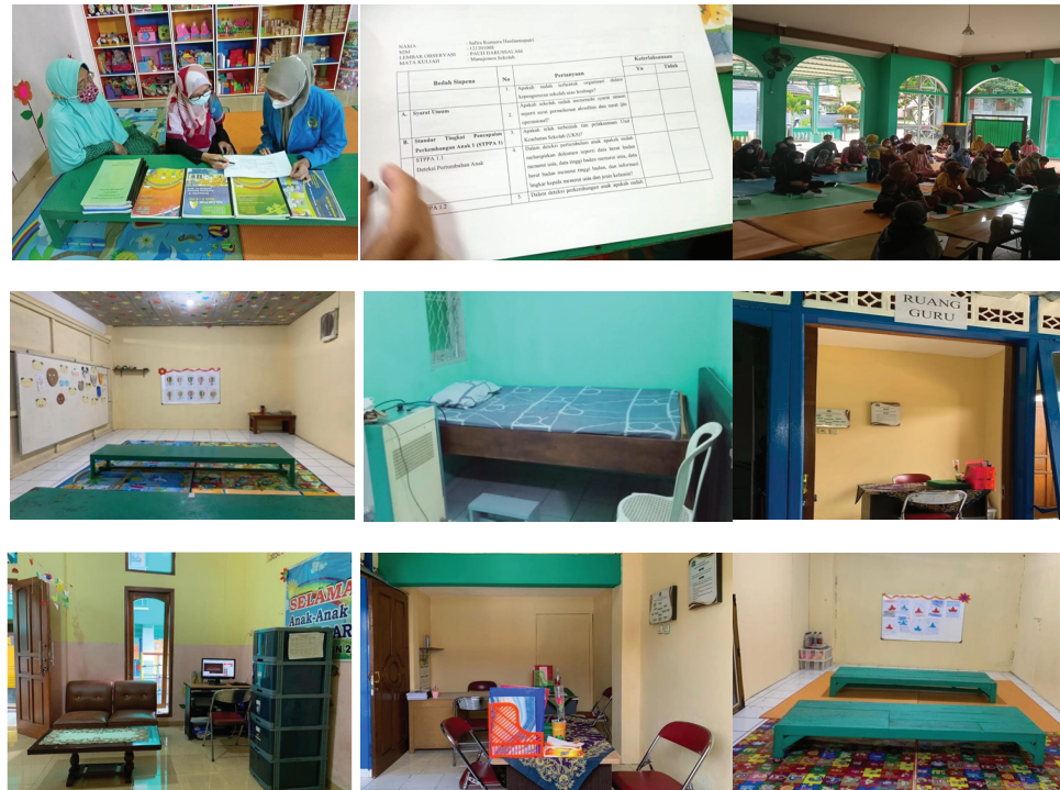
Figure 1: Description of Activities in Standard Facilities and Infrastructure Activities.

involving school management to meet the need to invite principals, teachers, Administration, committees, school administrators, and the community around the Pudak Payung Darussalam Early Childhood Education.