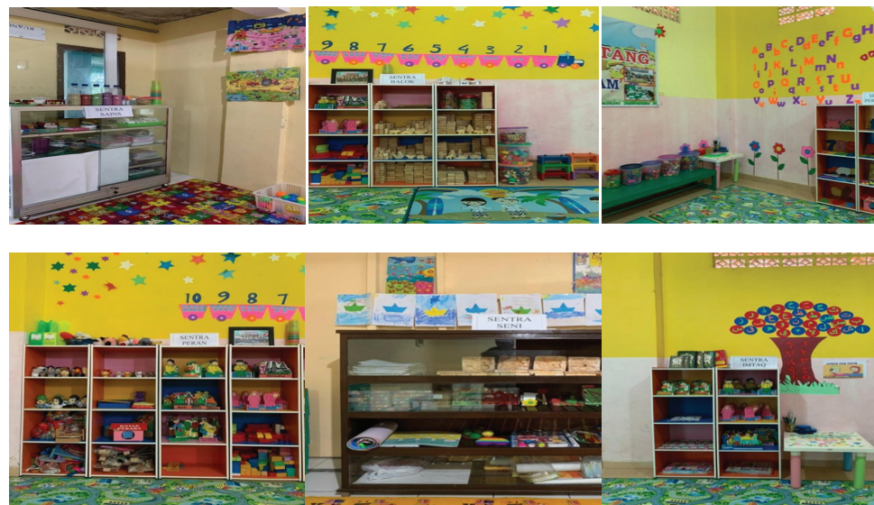
Figure 2: Description of Activities in Standard Facilities and Infrastructure Activities.

Regarding the standard of facilities and infrastructure at P4A Darussalam schools, we held a joint discussion involving school management staff to meet the need to invite