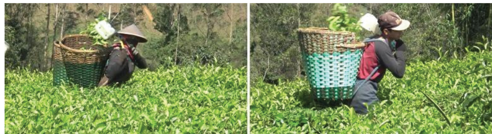
Figure 2: The activity of putting tea leaves in a basket.