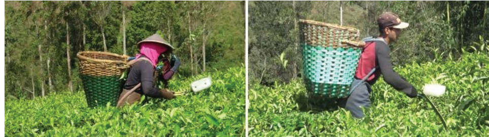
Figure 1: Tea shoot cutting activity.

results obtained in one transportation are more and more. The tea leaf picking process is shown in Figures 1 - 3.